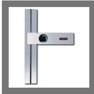
Engineer's Steel Square