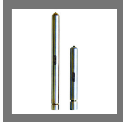
Single Point Diamond Dresser