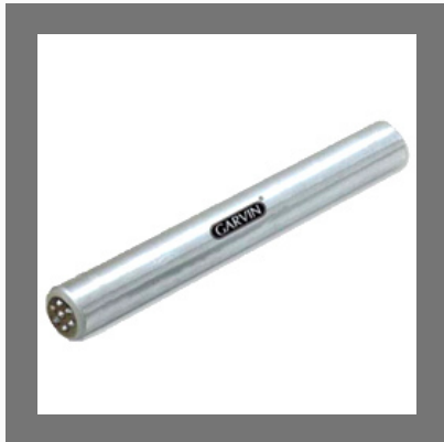
Cluster Diamond Dresser Multi Point