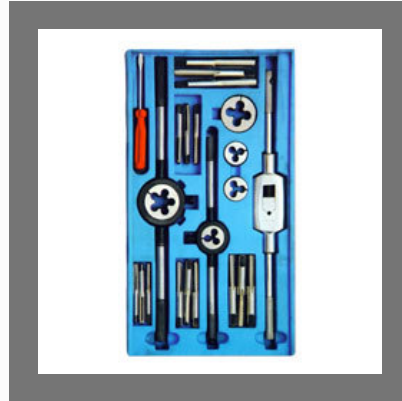
Complete Taps & Round Dies Sets