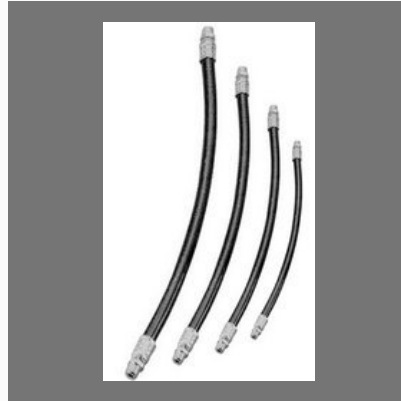
Grease Gun Hose