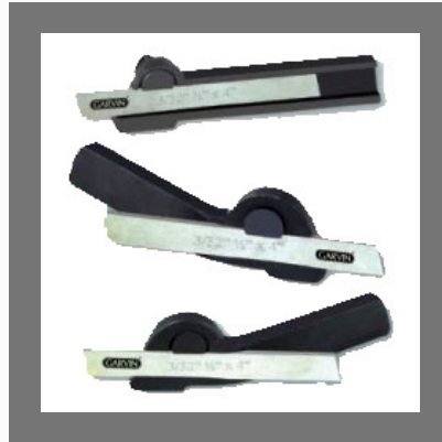
Parting Tool Holder