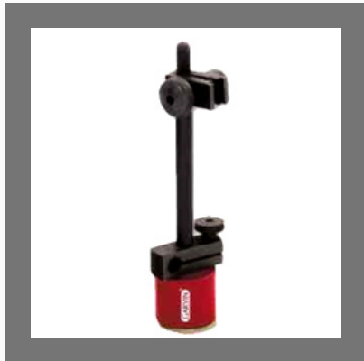
Mini Magnetic Stand