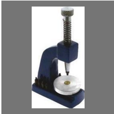
Hand Presser with Center Spring