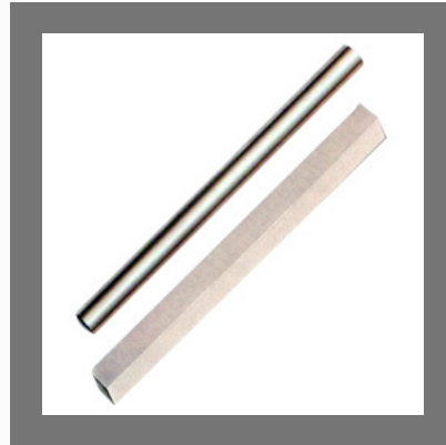
HSS Tool Bits