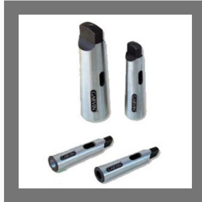
Drill Sleeves / Reduction Sleeves