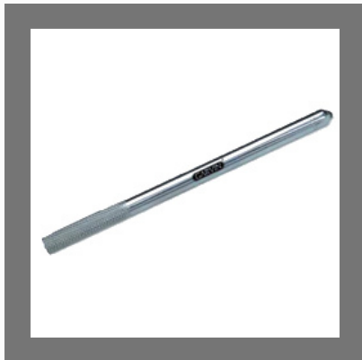
Diamond Dresser Knurled Body