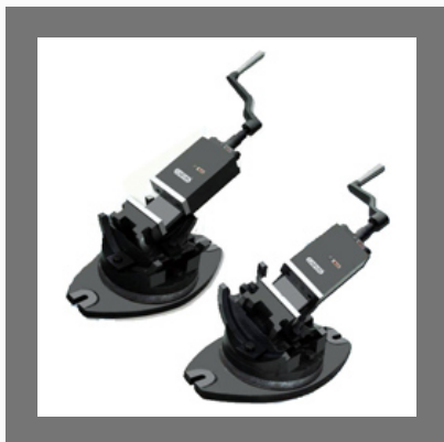
Tilting & Swivel Angle Vices