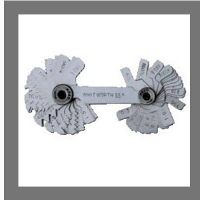
Screw Pitch & Thread Gauges