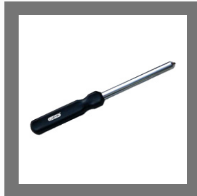
Diamond Dresser Hand Style