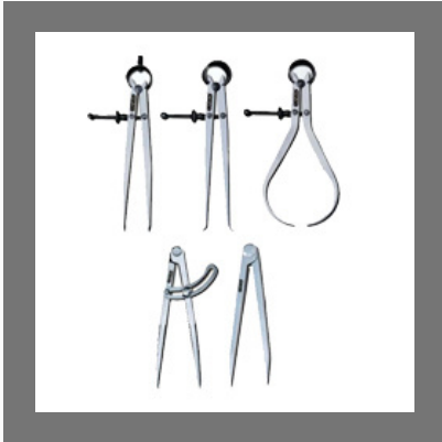
Spring Calipers, Wing Compass & Wing Dividers