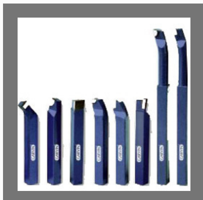
Brazed Carbide Lathe Turning Tools