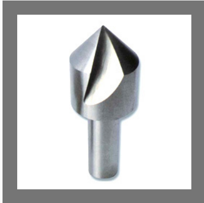
HSS Single Flute Countersinks