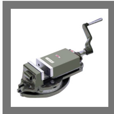
Milling Machine Vices