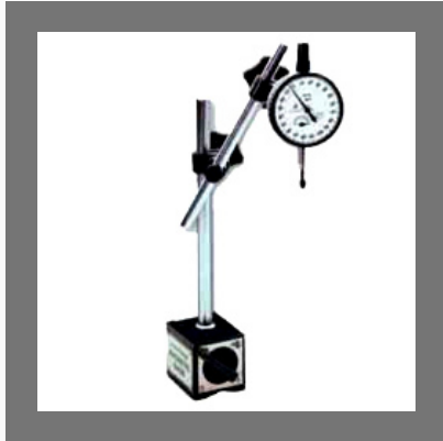
High Power Magnetic Base