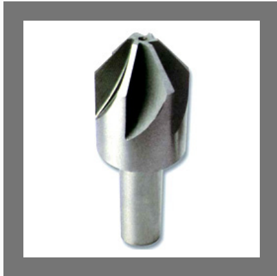
HSS Dovetail Cutter