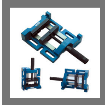
Unigrip 3-Way Drill Press Vices