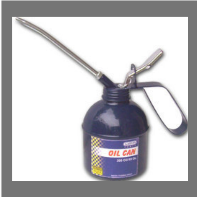
Pump Oil Cans