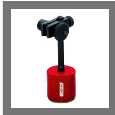
Mini Magnetic Base