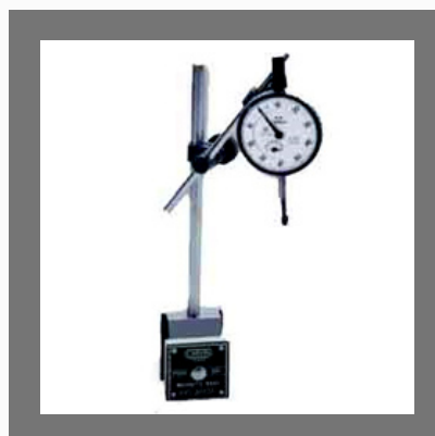
Magnetic Base Push Button