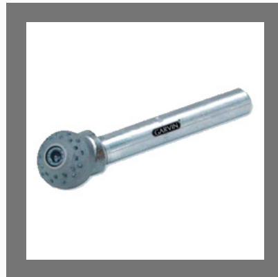
Multi Point Diamond Dresser - Indexable Crown