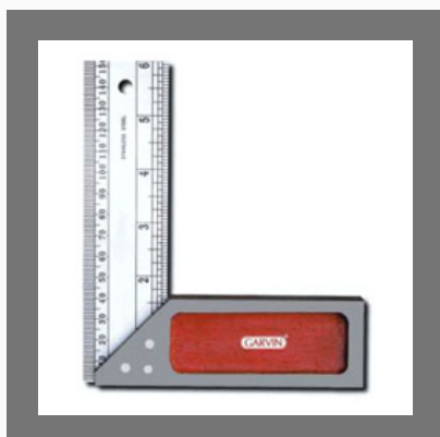
Carpenter's Steel Squares