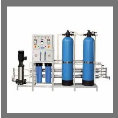
Automatic FRP RO Plant