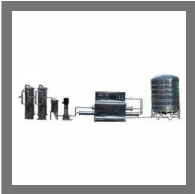
Packaged Drinking Mineral Water Plant