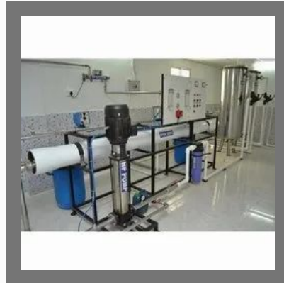
Automatic Stainless Steel RO Mineral Water Plant