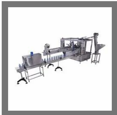
Bottled Drinking Water Bottling Plant