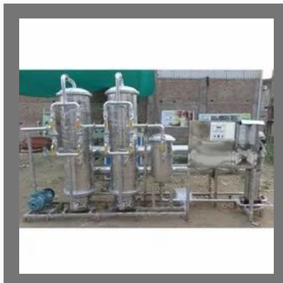
Automatic Textile Industries RO Plant