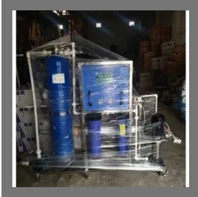
Industrial Reverse Osmosis Water System