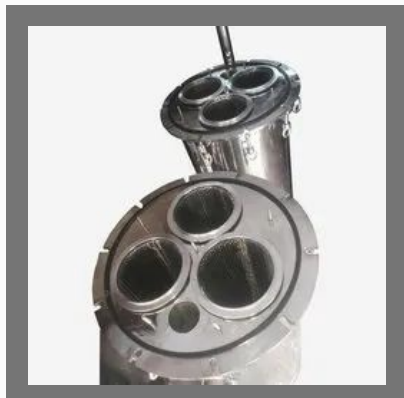
SS Micron Cartridge Filter Housing 304/316