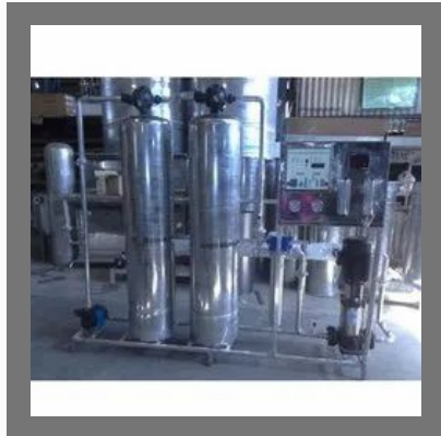
Automatic 500 LPH SS RO Plant