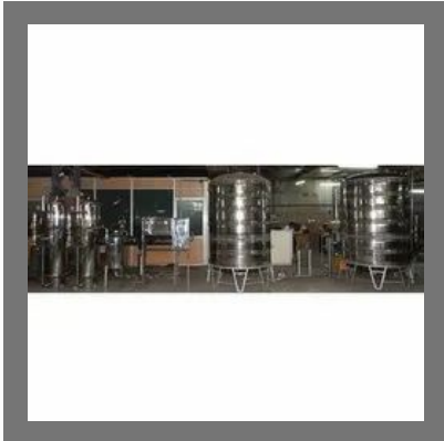
Industrial Mineral Water Turnkey Plant