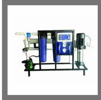
Commercial Reverse Osmosis System