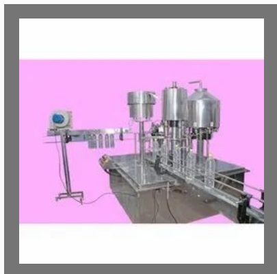
Water Filling Machine