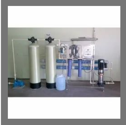
Industrial 1000 LPH FRP RO Plant