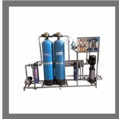
Commercial Mineral Water Purification Plant