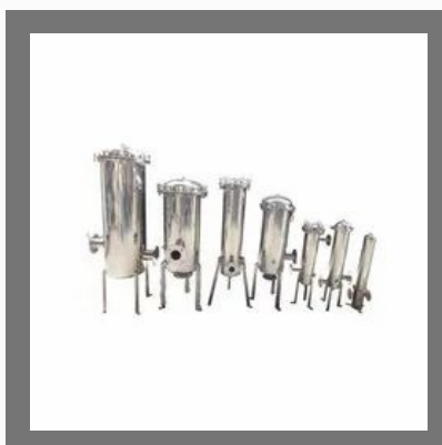
Industrial Micron Cartridge Housing