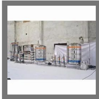
SS ISI RO Plant 2000 LPH