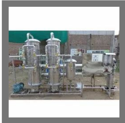
Automatic SS Reverse Osmosis Systems