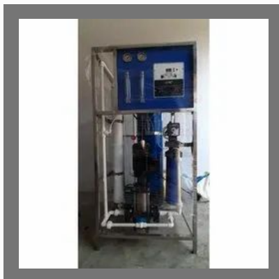
250 LPH Commercial RO Plant