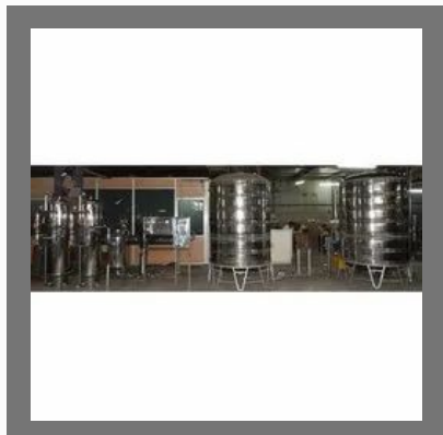
Turnkey Water Treatment Projects