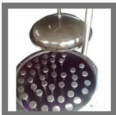
Multi Bag Filter Housing