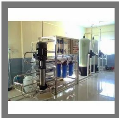
Industrial Mineral Water RO Plant