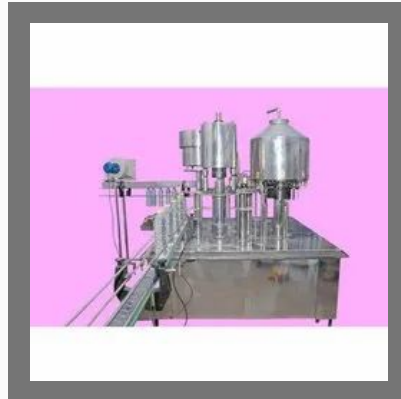
Packaged Drinking Water Plant