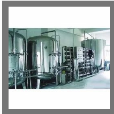
10000 LPH MWP Reverse Osmosis Plants