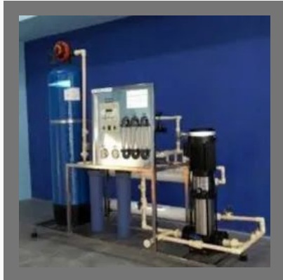
FRP 2500 LPH Reverse Osmosis Plant