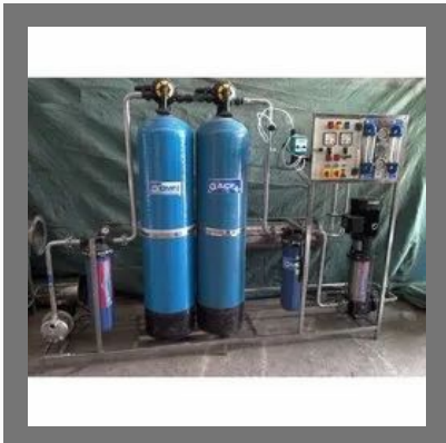
FRP Reverse Osmosis Plant With All SS Piping