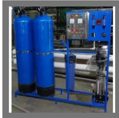
1000 LPH FRP RO Plant