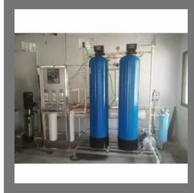
Fully Automatic Industrial RO Plant