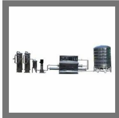
Drinking Water Treatment Project