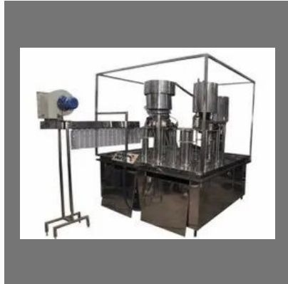
Turnkey Water Bottle Plant