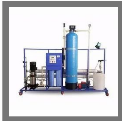
FRP 1000 LPH Mineral Water RO Plant