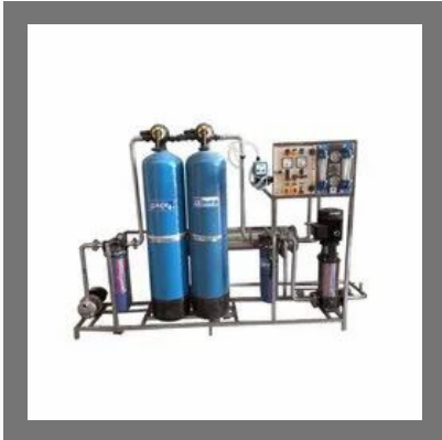
Reverse Osmosis System