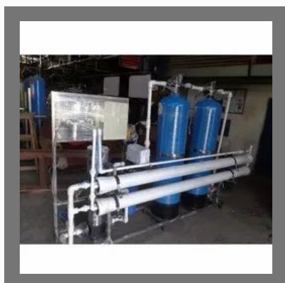
Industrial Water Purifier