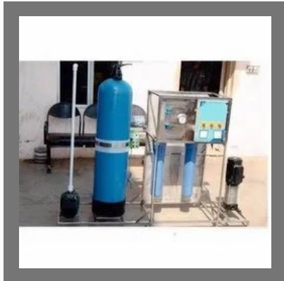
Packaged Mineral Water Plant