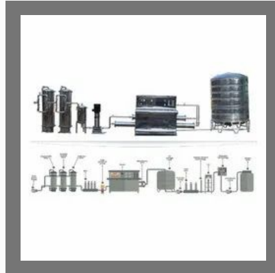
Turnkey Packaged Water Bottling Plant