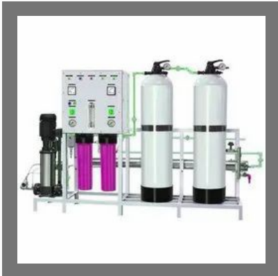
Commercial Water Purifier