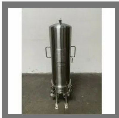
Stainless Steel Cartridge Filter Housing