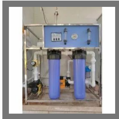
Commercial Water Purification Plants