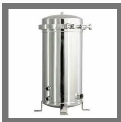
Stainless Steel Multi Bag Filter Housing