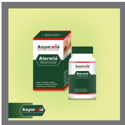
Alerwia Prevents Allergies Tablets