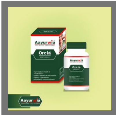
Orcia Bone Health Tablets