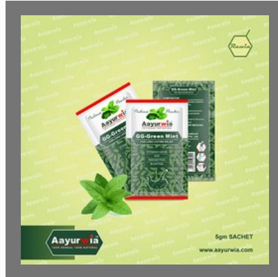
GG- Green Mint Sachet