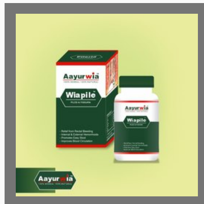
Pileria Piles And Fissura Tablets