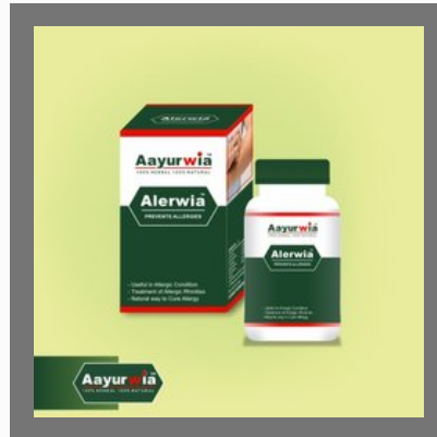
Alerwia Prevents Allergies Capsules