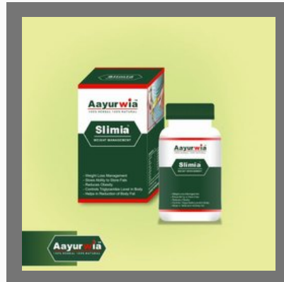
Herbal Weight Loss Tablet