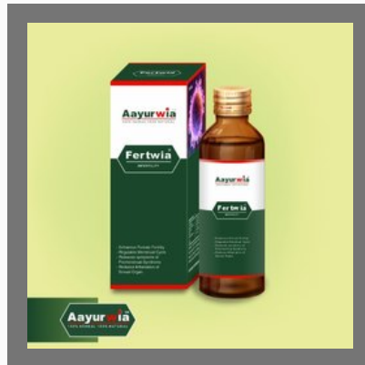
Fertiwia Infertility Tablets