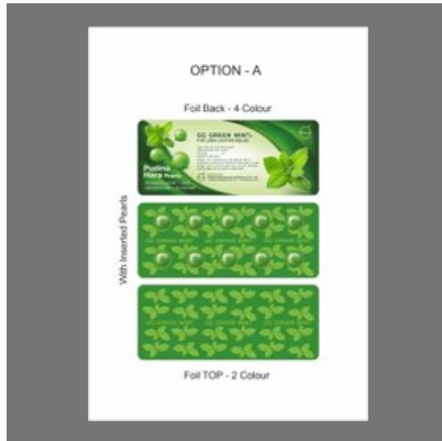
GG-Green Mint Pearls