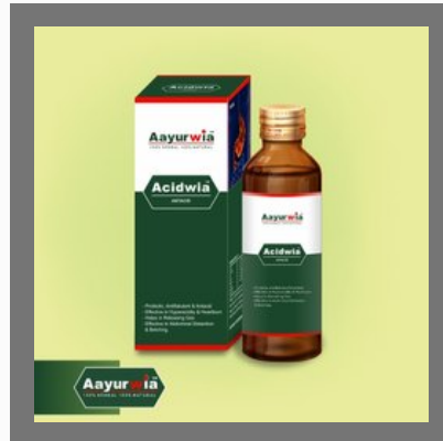
Acidwia Antaco Syrup