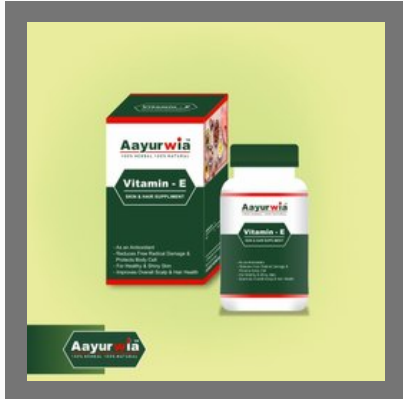
Vitamin-E Skin and Hair Supplement Capsule