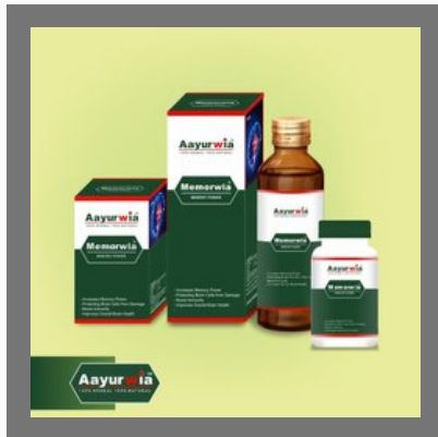
Memorwia Memory Power Capsule