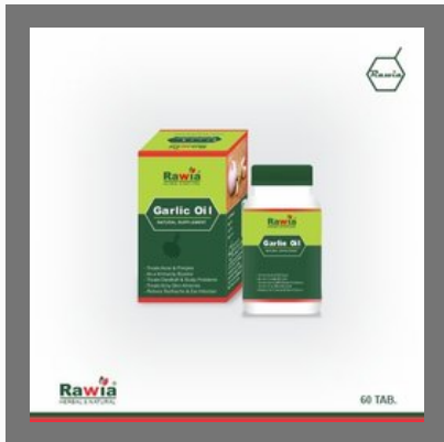
Garlic Oil Capsule