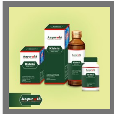
Kidnia Kioney Health Tablet