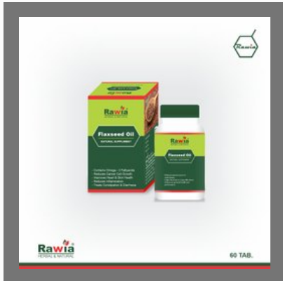
Flaxseed Oil Capsule