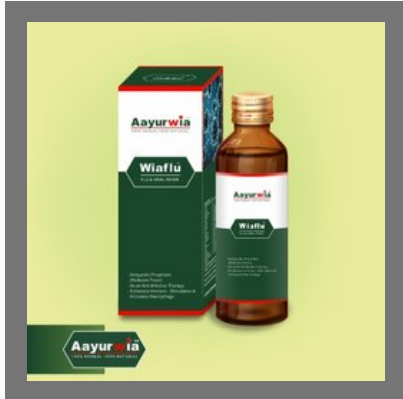
Wiaflu Flu and Viral Fever Syrup