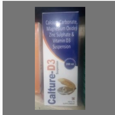
Cultural 3D Oral Suspension