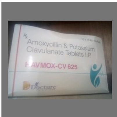
Amoxicillin Potassium Tablet