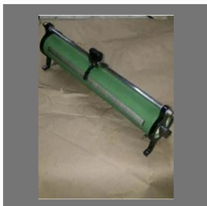
Wire Wound Rheostats