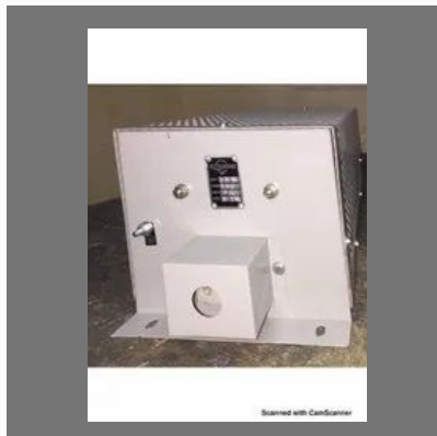
2K Wire Wound