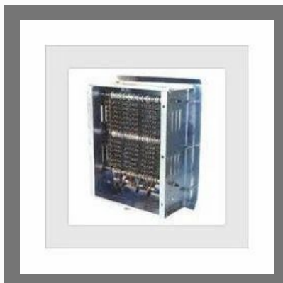
Wire Grid Resistance