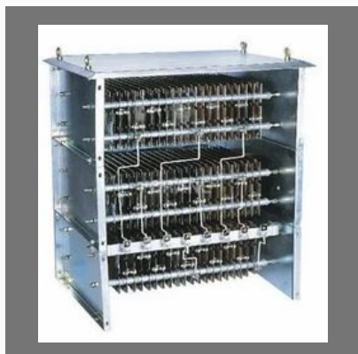
Punch Grid Resistance