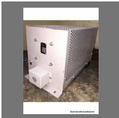
4K Wire Wound