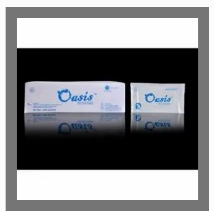
Oasis Single Mini Wet Wipes