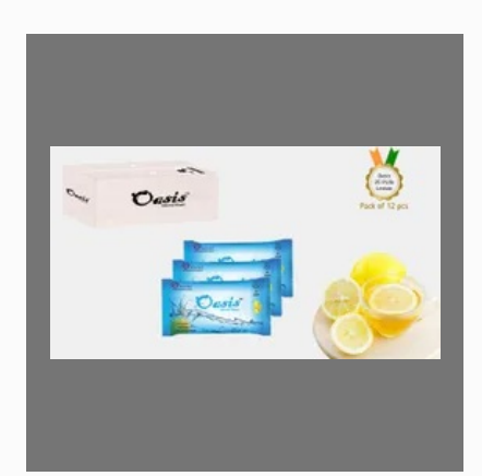
Oasis Natural Wipes 25 Pulls Packs with Lemon Fragrance