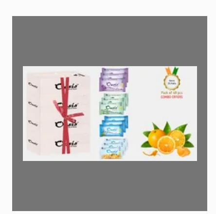
25 Pulls Combo Offers