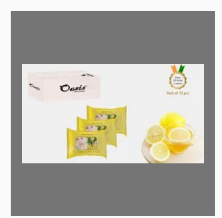
Pure Natural Wipes - 25 Pulls Packs With Lemon Fragrance.