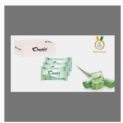
Oasis Natural Wipes 15 Pulls Packs with Aloevera & Cucumber Fragrance