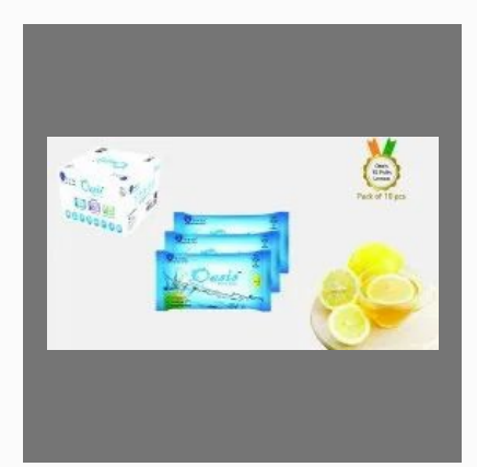
Oasis Natural Wipes 10 Pulls Packs with Lemon Fragrance