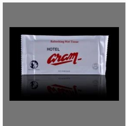
Hotel Aram Single Wet Wipes