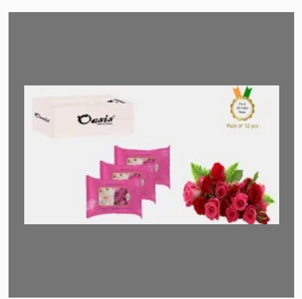
Pure Natural Wipes 25 Pulls Packs With Rose Fragrance