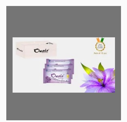
Oasis Natural Wipes 20 Pulls Packs with Lavender Fragrance