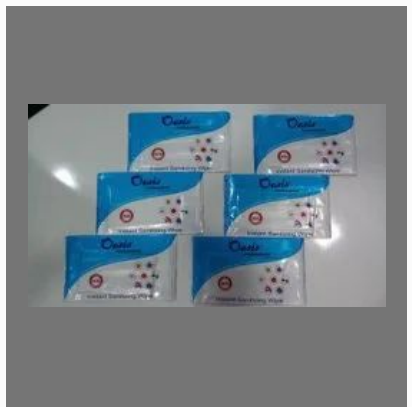
Oasis Instant Sanitizing Wipes - Single