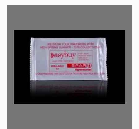
Easy Buy life Style International Single Wipe