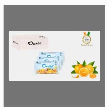
Oasis Natural Wipes 25 Pulls Packs with Orange Fragrance