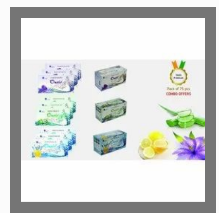
Premium Combo Offers 75 Pcs