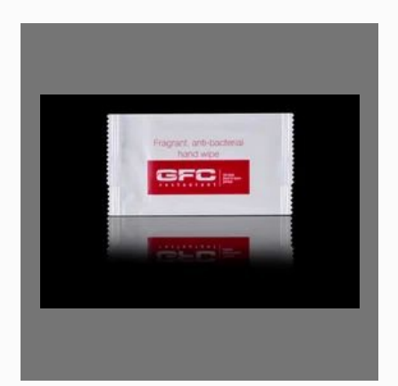
GFC Single Wipes