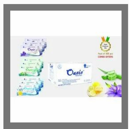
Premium Combo Offers 300 Pcs