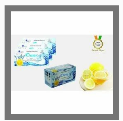
Oasis Natural Wipes Premium With Lemon Fragrance