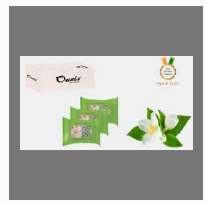
Pure Natural Wipes 25 Pulls Packs With Jasmine Fragrance