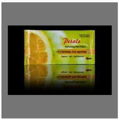
Petals Single Wipes