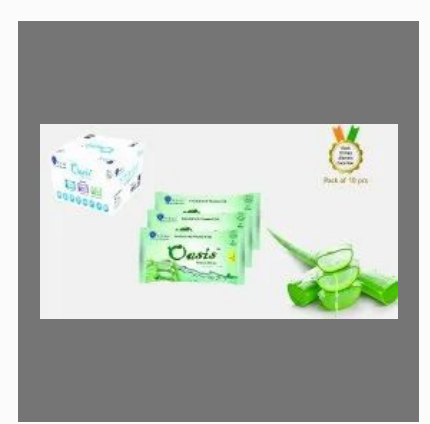
Oasis Natural Wipes 10 Pulls Packs With Aloevera & Cucumber