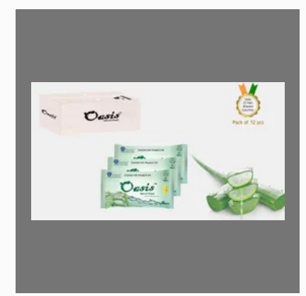
Oasis Natural Wipes 25 Pulls Packs with Aloe Vera & Cucumber Fragrance