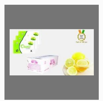
Oasis Hotel Wipes Mini with Lemon Fragrance