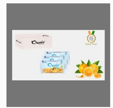
Oasis Natural Wipes 20 Pulls Packs with Orange Fragrance