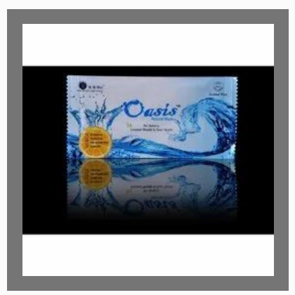
Oasis Premium Wet Wipes