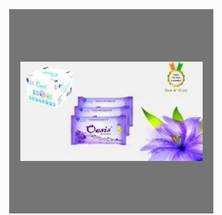
Oasis Natural Wipes 10 Pulls Packs with Lavender Fragrance