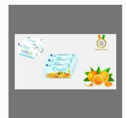
Oasis Natural Wipes 10 Pulls Packs with Orange Fragrance