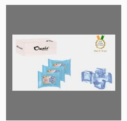
Pure Natural Wipes 25 Pulls Packs With Icy Cologne Fragrance