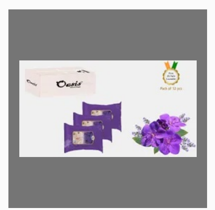
Pure Natural Wipes 25 Pulls Packs With Lavender Fragrance