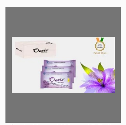
Oasis Natural Wipes 25 Pulls Packs with Lavender Fragrance