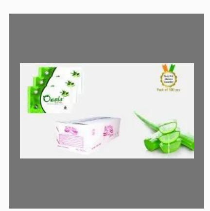
Oasis Hotel Wipes Mini with Aloe Vera & Cucumber Fragrance