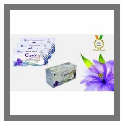
Oasis Natural Wipes Premium With Lavender Fragrance