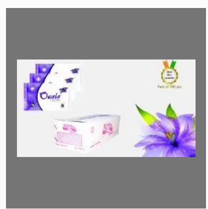
Oasis Hotel Wipes Mini with Lavender Fragrance