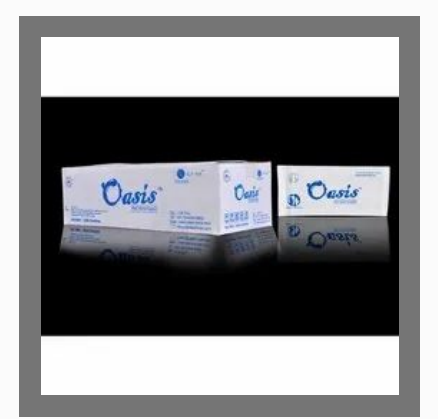
Oasis Single Regular Wet Wipes