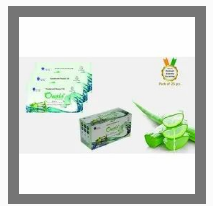
Oasis Natural Wipes Premium With Aloevera & Cucumber Fragrance