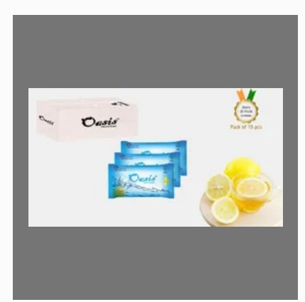
Oasis Natural Wipes 20 Pulls Packs with Lemon Fragrance