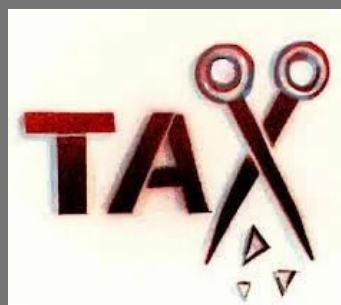
Taxation Advisory Services