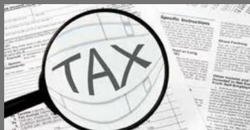
Income Tax Services