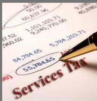
Service Tax Services