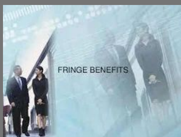
Fringe Benefit Tax Services