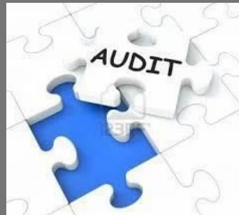
Stock Audit Assurance Services