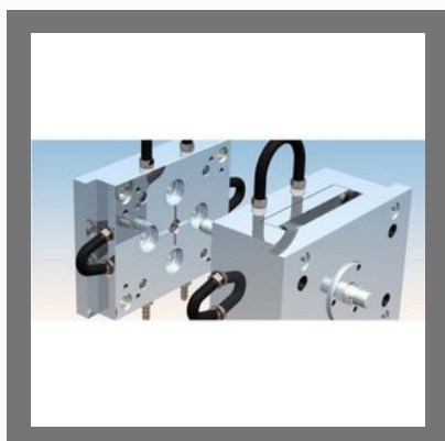
4 Cavity Injection Moulding Dies