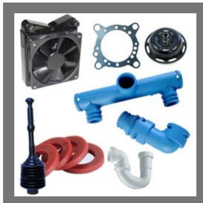
Automotive Plastic Injection Moulded Components