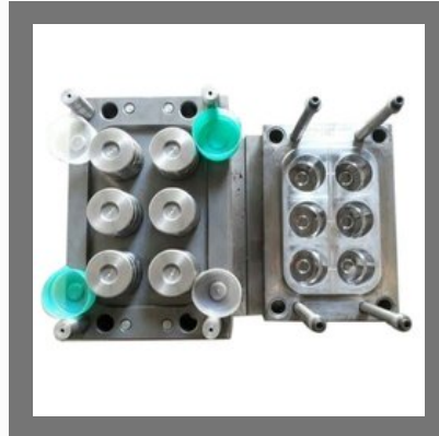
Water Jar Cap Plastic Moulding Dies