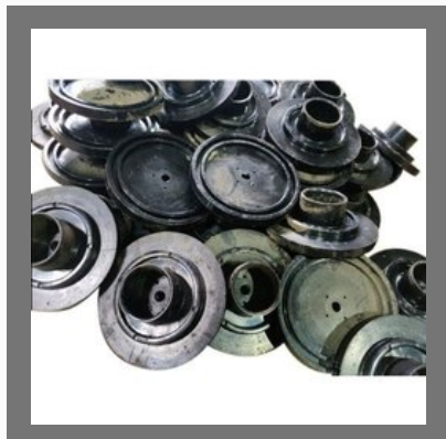
Plastic Injection Moulded Components