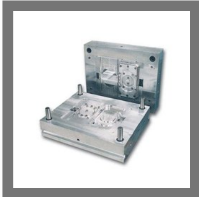
2 Cavity (Extension box )Plastic Moulding Dies