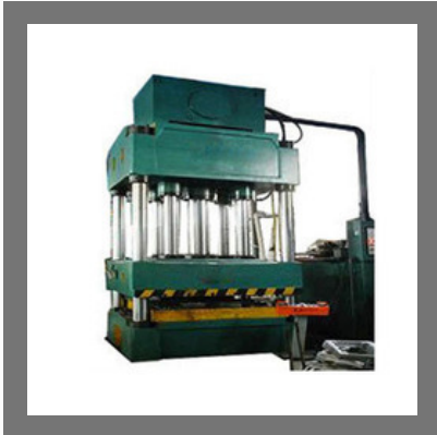
Hydraulic Machines Repairing