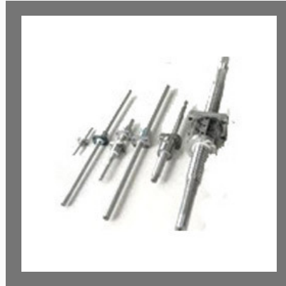
Miniature Ball Screw Repairing