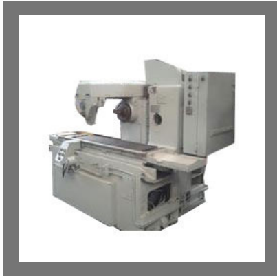
Milling Machines Repair Services