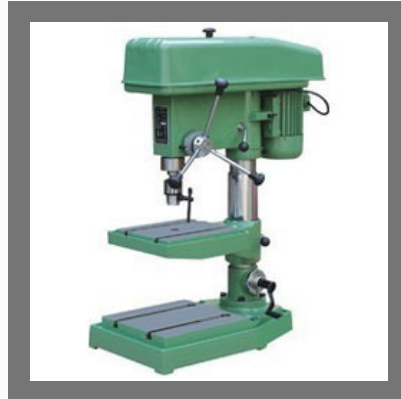
Bench Drill Machines