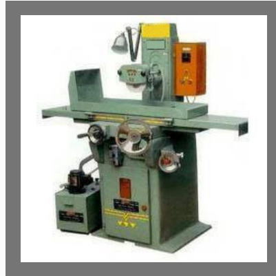
Surface Grinder Repairing