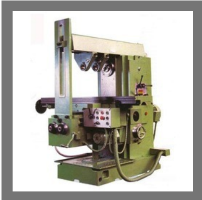
HMT Machine Repairing