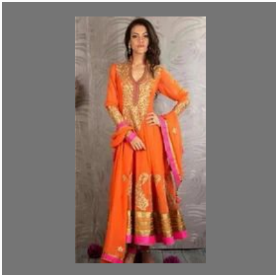
Orange And Gold Anarkali Suit