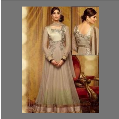
Gold Shade Anarkali Suit