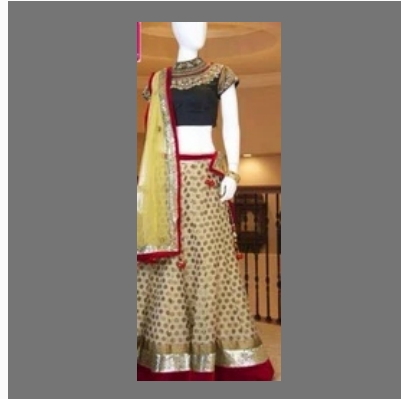
Gold And Black Lehenga