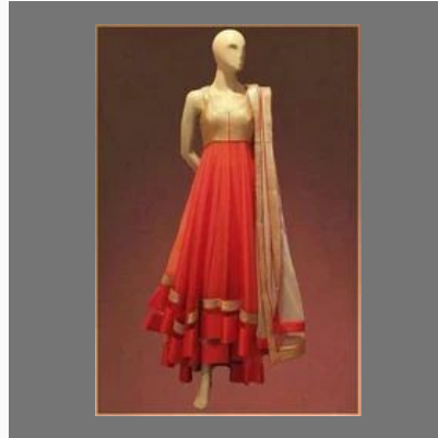
Ladies Designer Suits