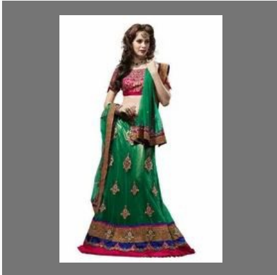
Green And Pink Lehenga