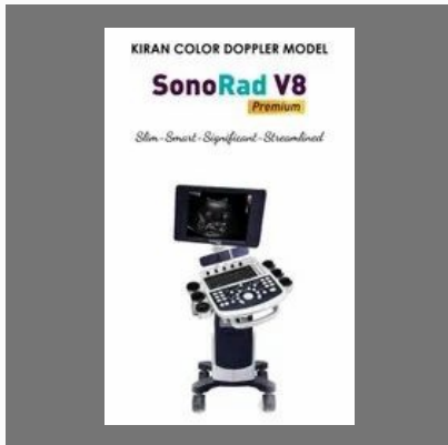
Kiran Color Doppler Model SonoRad V8 Premium