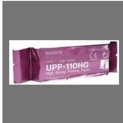
Sony Ultrasound Thermal Paper Roll - High Glossy (HG)