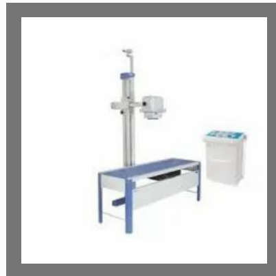
Epsilon Line Frequency X- Ray System EP-300