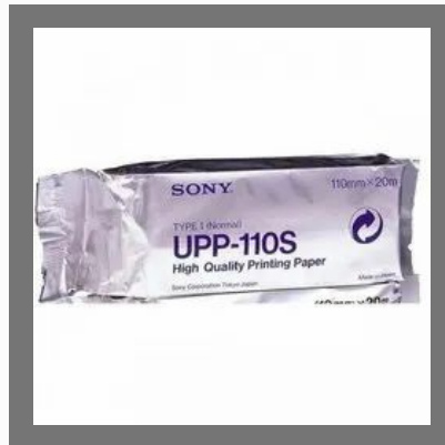
SONY THERMAL PRINTER PAPER ROLL