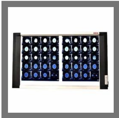
LED X Ray Double Film Viewer With Dimmer