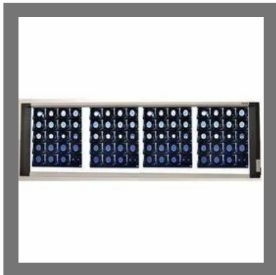
Rege LED X-Ray Four Film Viewer