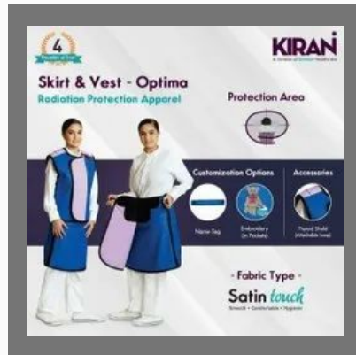
Radiation Protection Lead Skirt and Vests