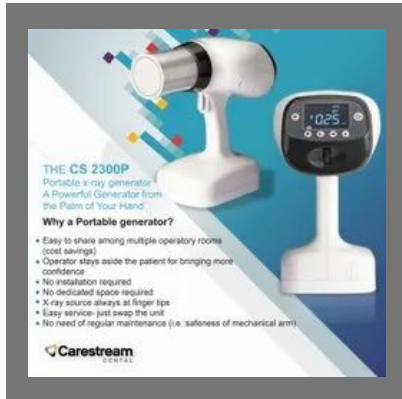
Carestream CS 2300 P