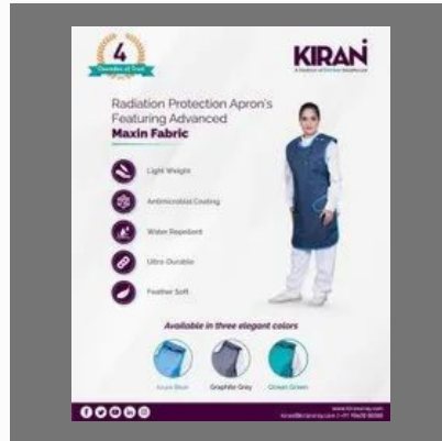
Radiation protection Lead Apron