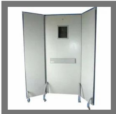
Rege Radiation Three Panel Protection Screen