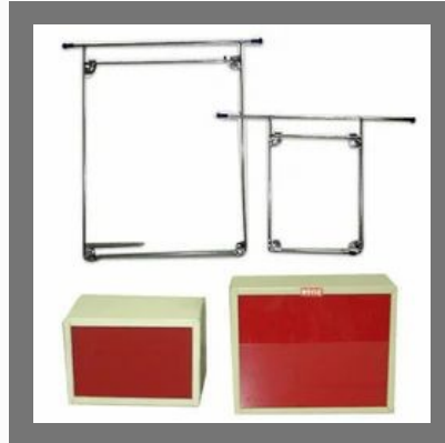
REGE X Ray Accessories