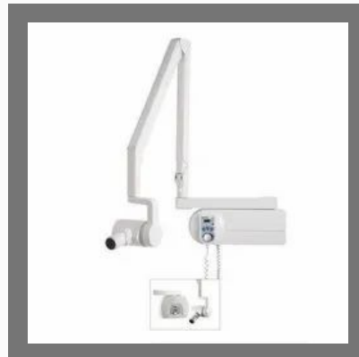
Carestream CS 2100 Dental X-RAY System