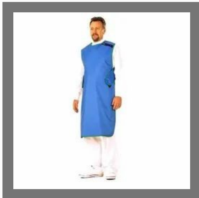
Surgical Lead Apron