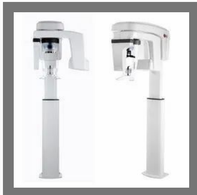
Carestream OPG Machine CS 8100