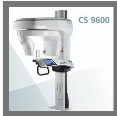
Carestream CS-9600 CBCT Machine