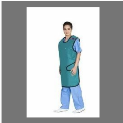
Radiation protection Leadlite Apron