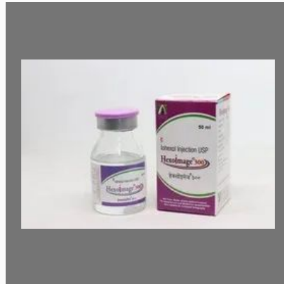
HexolImage CT Contrast