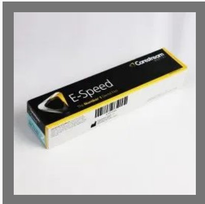
Carestream Dental X Ray Film