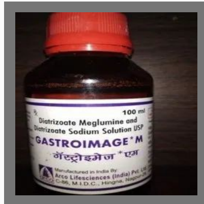
Gastroimage + M Contrast Medium