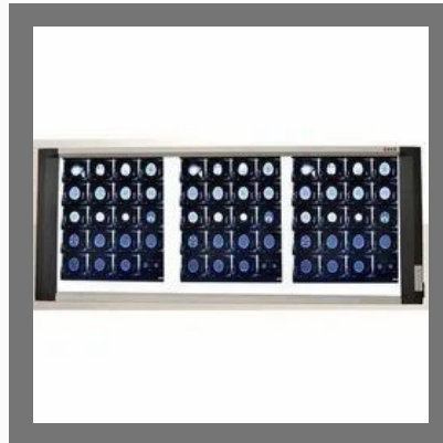
Rege LED X Ray Three in One View Box