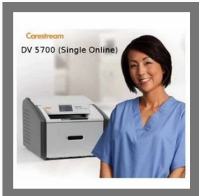
DV 5700 Dry Laser Printers