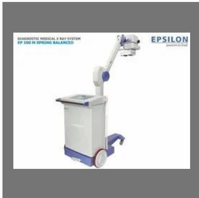
Epsilon - X Ray Machine Ep 100 Spring Balance