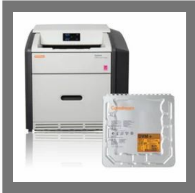
DV 5950 Laser Imager