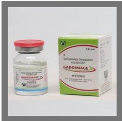
GadolImage Contrast Medium