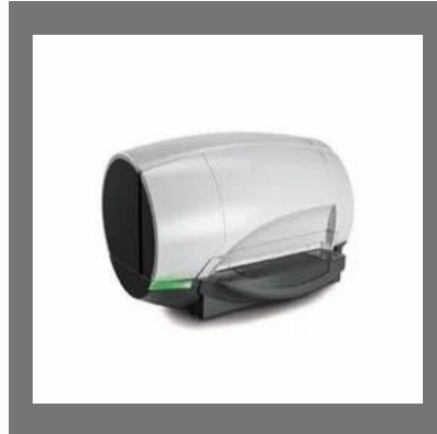
Carestream Vita Flex Cr System