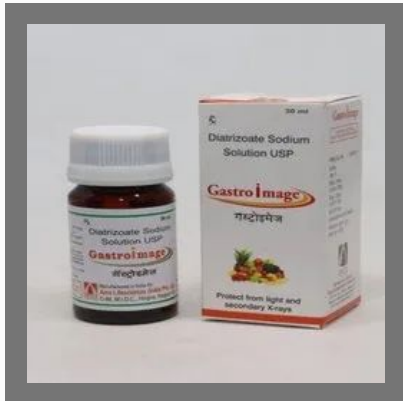
Gastro Image Oral Contrast