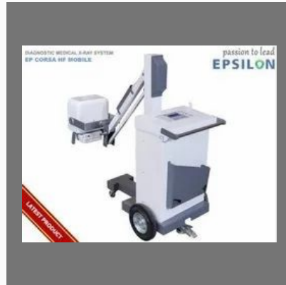
Epsilon Mobile X- Ray Machine