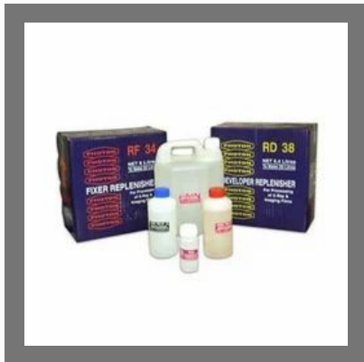
Photon X Ray Processing Chemicals