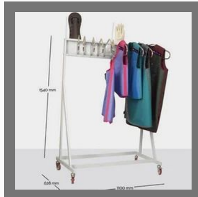
X Ray Apron Hangers