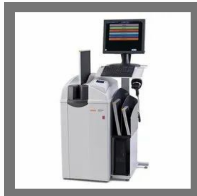
CARESTREAM CLASSIC CR SYSTEM DIRECTVIEW