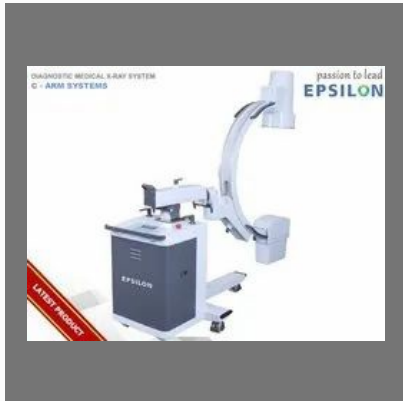
EPSILON C-ARM MACHINE 6 KW