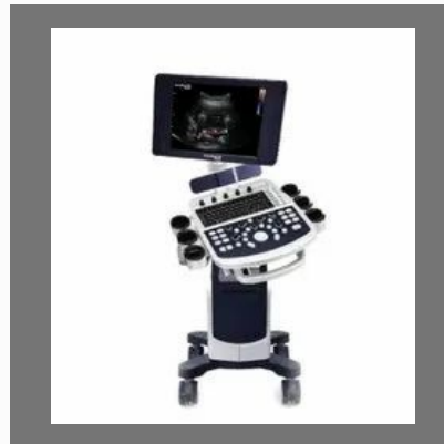
Trivitron Kiran Whole Body Performance Color Doppler Model Sonorad V20