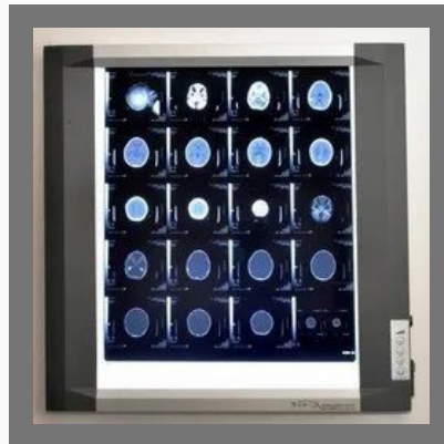
Rege LED X-Ray View Box - Single Screen