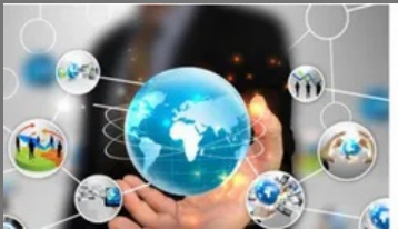
Intraday Cash Tips Services