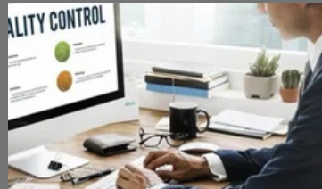
Swing Trading Picks Service