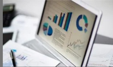
Stock Future Tips Services