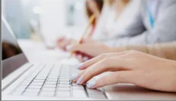
Positional Calls Service