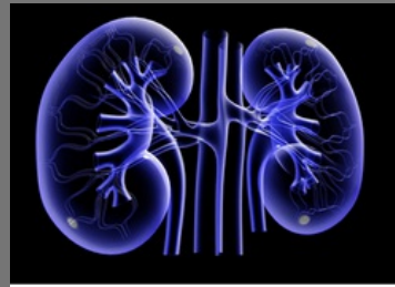
Nephrology And Urology Treatment Service