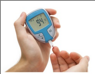
Diabetology Treatment Service