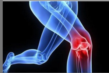
Orthopedics Treatment Service