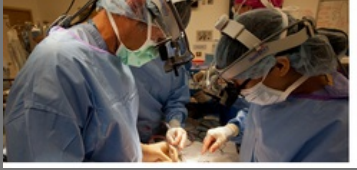
Cardiology Surgery Treatment Service