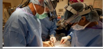
Neurology And Neurosurgery Treatment Service