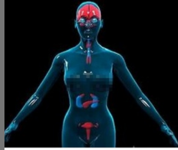
Endocrinology Treatment Service