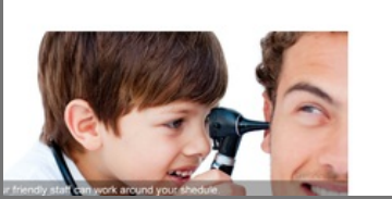
Pediatrics And Neonatology Treatment Service