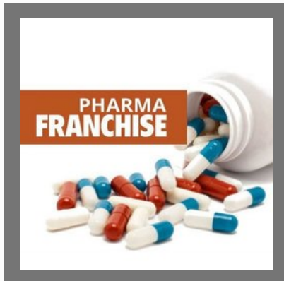
PCD Pharma Franchise For Assam