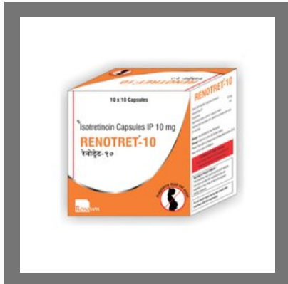
Isotretinoin Capsules IP 10 Mg