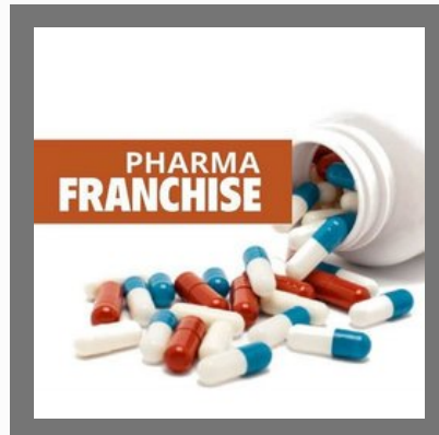
PCD Pharma Franchise For Bihar