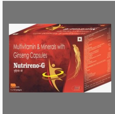
Multivitamin And Minerals with Ginseng Capsules