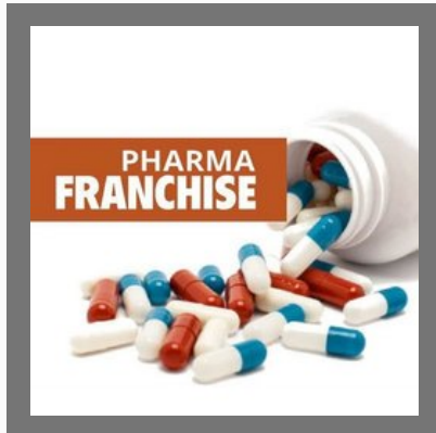
PCD Pharma Franchise For Andhra Pradesh