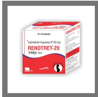
Isotretinoin Capsules IP 20 mg