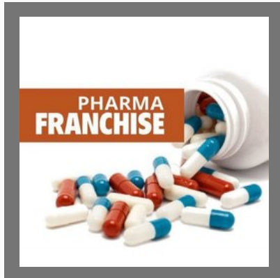
PCD Pharma Franchise For Chhattisgarh