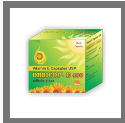
Orbicop-E 400 Vitamin E Capsules USP