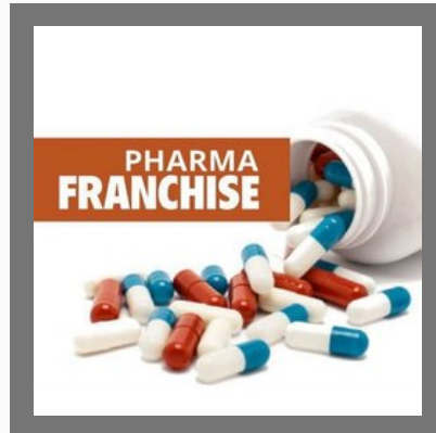
PCD Pharma Franchise For Arunachal Pradesh