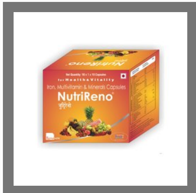
Iron, Multivitamin And Minerals Capsules