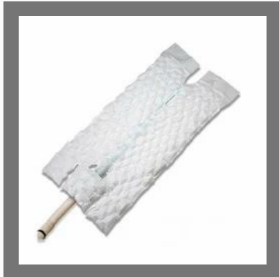
Covidien WarmTouch Patient Warmer Blankets