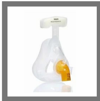
Philips AF421 EE leak 2 Elbow Vented NIV Mask