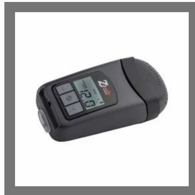
Breas Z2 Auto Travel CPAP