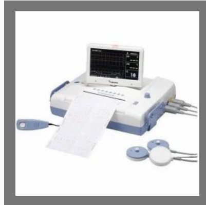
Bistos BT350 Fetal Monitor CTG Machine with 7inch Screen