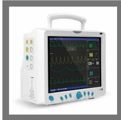
Contec CMS9000 Multipara Patient Monitor 12.1 Inch Display