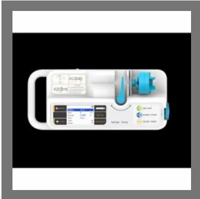
Contec SP950 Precise Infusion Syringe Pump