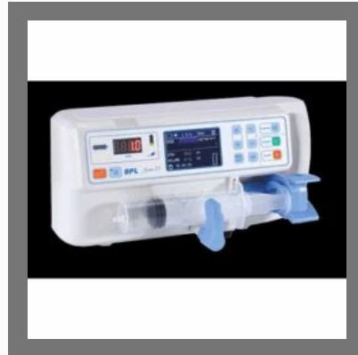
BPL Acura S1 Syringe Pump