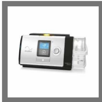
Resmed BiPAP Lumis 150 ST-A