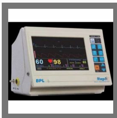
BPL Magna 3 Para Patient Monitor (Spo2, NIBP, ECG)