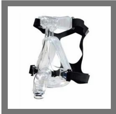
ResMed BestFit 2 Full Face Mask