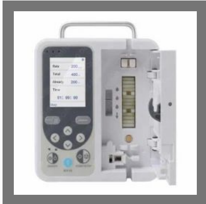
Contec SP750 Volumetric Infusion Pump