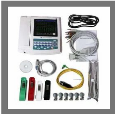
Contec 1200G 12-Channel ECG Machine