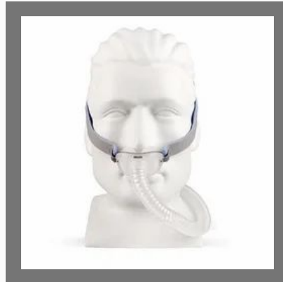
ResMed P10 Nasal Pillow Mask