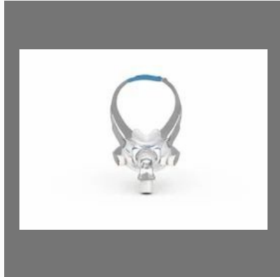
Resmed Airfit F30 Full Face Mask