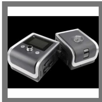
BMC RESmart GII Auto CPAP with Humidifier