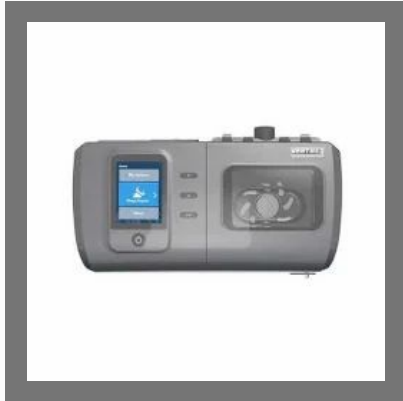
VentMed DS6 Auto CPAP with Humidifier and Nasal Mask