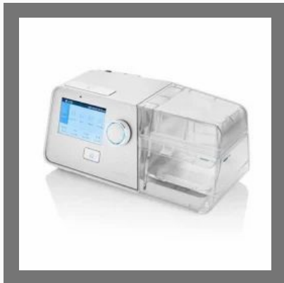
BMC G3 B30VT BIPAP Device with Humidifier and Mask