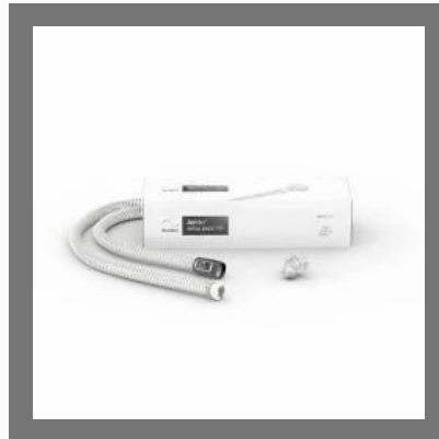
Resmed F20 F30 AirMini Setup Pack