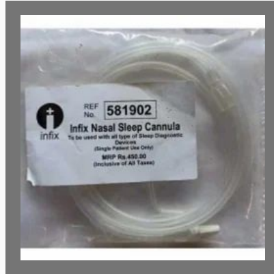
Infix Nasal Cannulas for Sleep Study