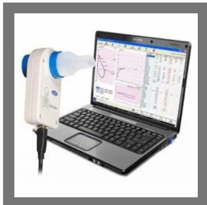
Clarity SpiroTech PC Based Spirometer