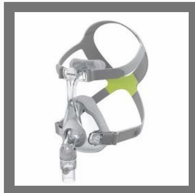
Lowenstein Joyce One Full Face Mask