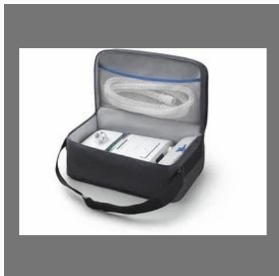
Philips DreamStation Auto CPAP with Humidifier & Mask (Bundle)