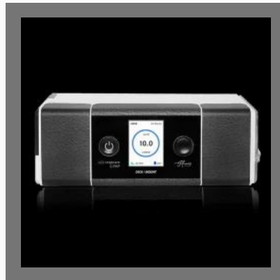
Deckmount Harmony Auto CPAP-VT50D