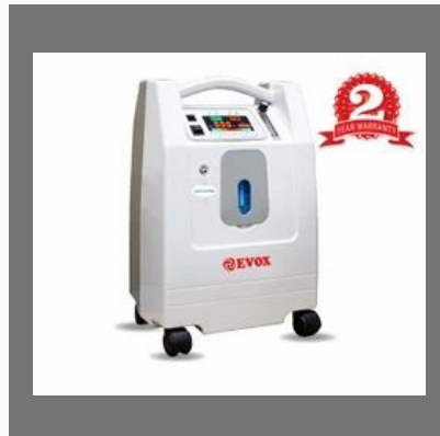
Evox-5S Oxygen Concentrator 5 LPM