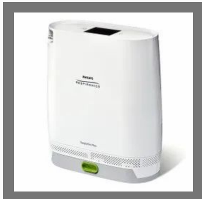
Philips Simplygo Mini Portable Oxygen Concentrator