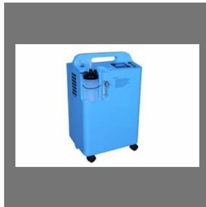
MedOxy Jay5BW 5Ltr Medical Grade Oxygen Concentrator