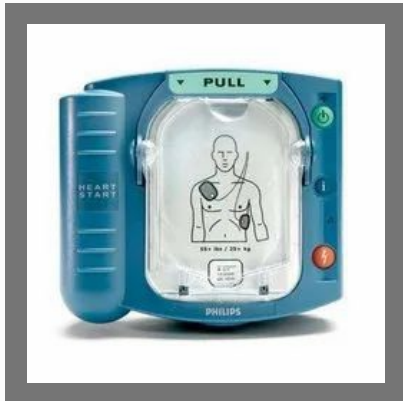
Philips Heartstart HS1 Onsite AED Defibrillator