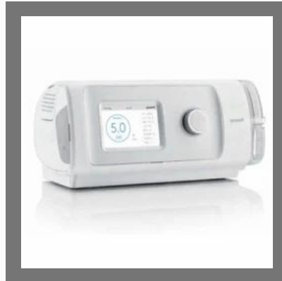
Yuwell Breathcare YH830 BIPAP