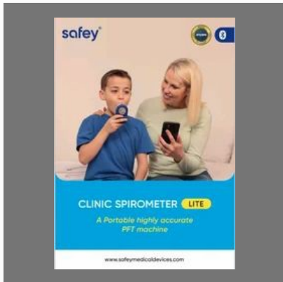
Safety Clinic Spirometer