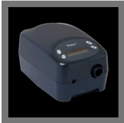
Resmed Floton S 20 Bipap Device with Full Face Mask