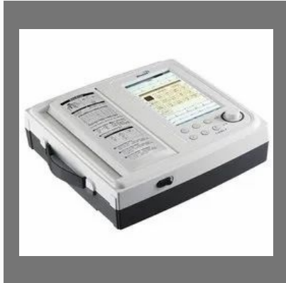
Bionet Cardio 7- 12 Channel ECG