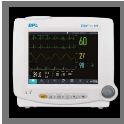
BPL EliteView EV8 Patient Monitor