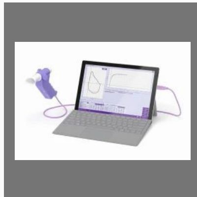
NDD Easy On PC Spirometer