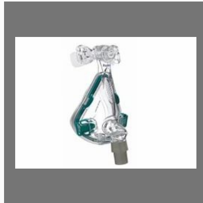
Resmed Mirage Quattro Full Face Mask