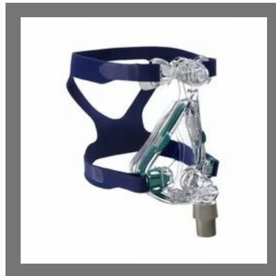
ResMed Mirage Quattro CPAP Full Face Mask