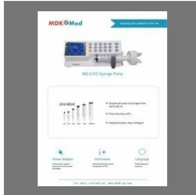
MDK Med Touch Screen Syringe Pump