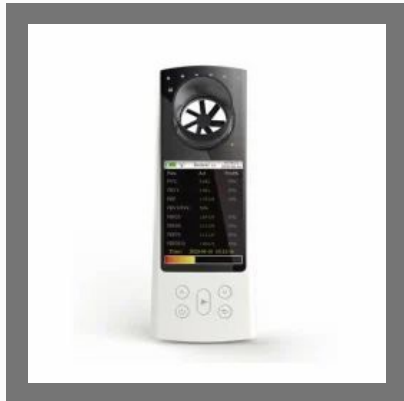
CONTEC SP80B Color Display Spirometer with Software and USB