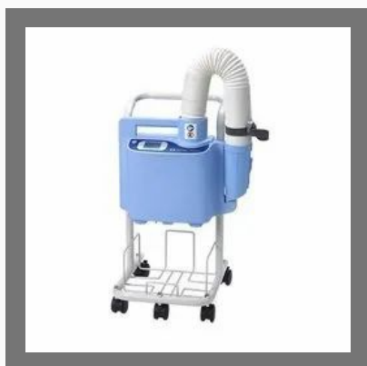
Covidien WarmTouch 6000 Patient Warmer