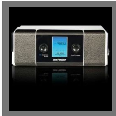
Deckmount Sleep Magic Pro Auto CPAP-VT50