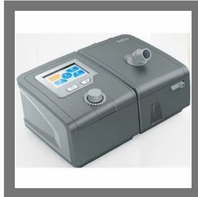
Byond ResPlus B-30P BIPAP With Humidifier & Mask