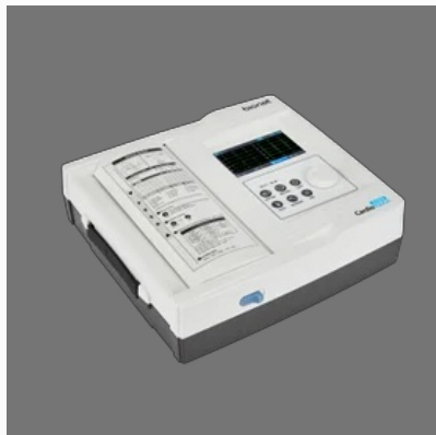
Bionet CardioTouch-3000 12-Channel ECH EKG