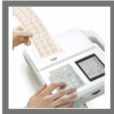
COMEN CM300 3-Channel ECG