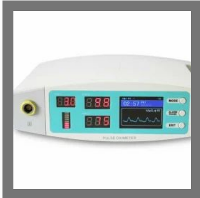
Contec CMS70A Portable Tablet Pulse Oximeter