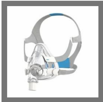
Resmed Airfit F20 Full Face Mask