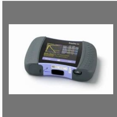
NDD EasyOne Air Portable & PC Spirometer