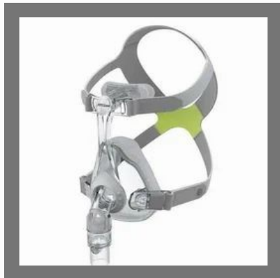
Lowenstein Joyce one Full Face Mask