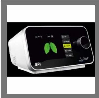
BPL LifePAP 25STA BIPAP Machine