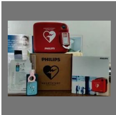
Philips Heart Start FRX Defibrillator