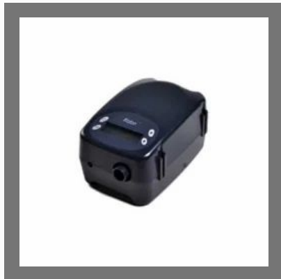
Resmed Floton ST 25-Bipap with Humidifier