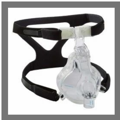
Philips Respironics Performa Trak Full Face Mask