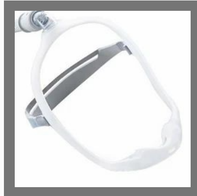
Philips Dreamwear Under The Nose Mask