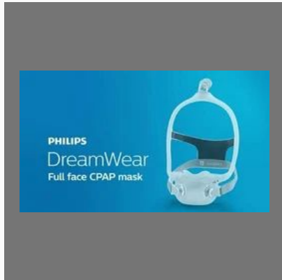
Philips Dreamwear Full Face Bipap Mask