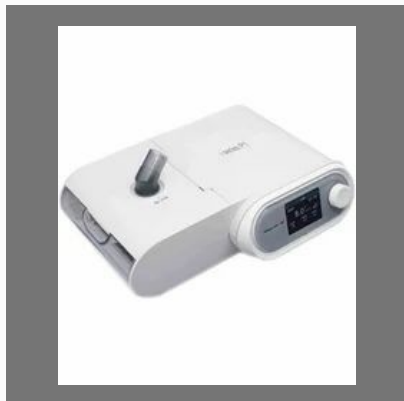
OxyMed Auto CPAP with Humidifier & Mask