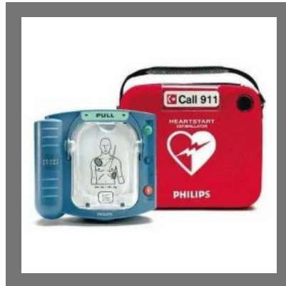
Phillips HeartStart HS1 AED Defibrillator