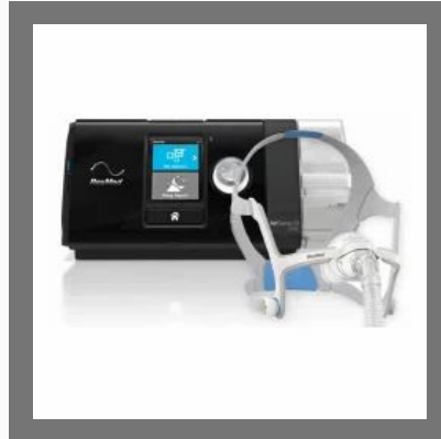
Resmed Airsense 10 + Airfit N20 Mask Bundle CPAP Pack