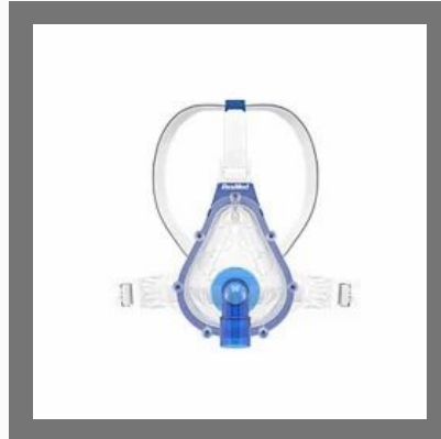
Resmed AcuCare F1-0 Hospital Non-Vented Full Face Mask