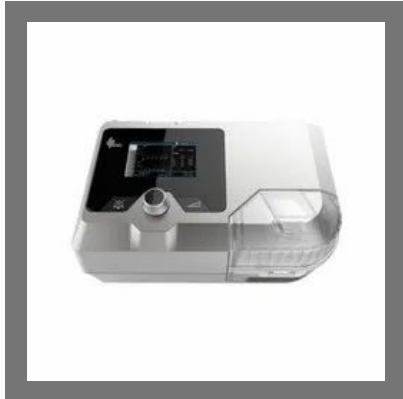
BMC G2S B25T BiPAP Machine