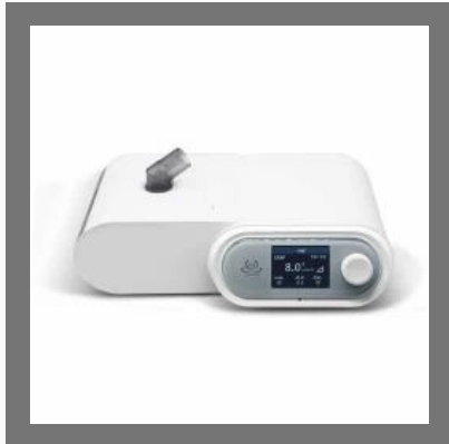
Micomme P1 BIPAP with Humidifier