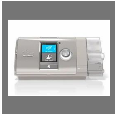
Resmed AirCurve 10 ST BiPAP Machine