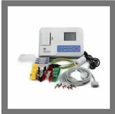
Contec 3-Channel ECG Machine 300G