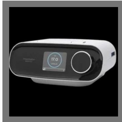
Philips Respironics DreamStation BIPAP AVAPS