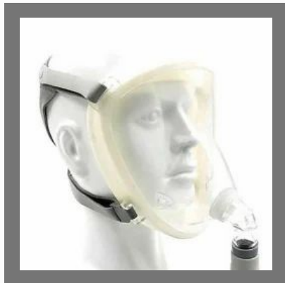
RespBuy Complete Face BIPAP Mask