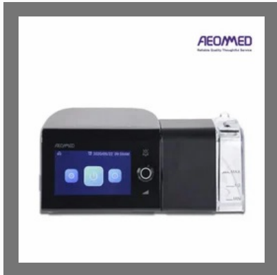
AEONMED BF30ST BiPAP Device with humidifier