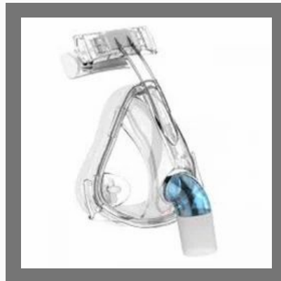
Respbuy NIV (Non vented) Ventilator Hospital Mask