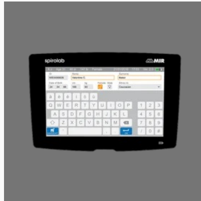
MIR Spirolab Touch Screen Portable Desktop Spirometer