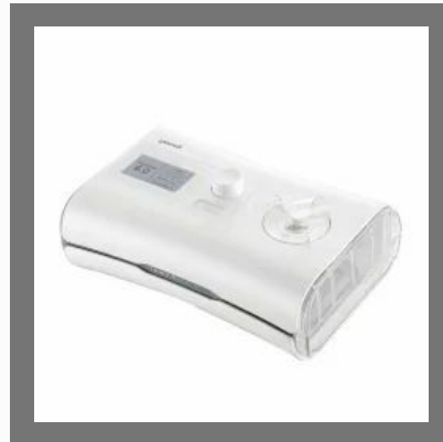
Yuwell YH550 Auto CPAP with Humidifier