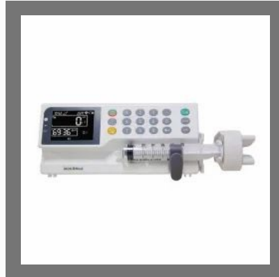
MDKMed MS51 Syringe Pump