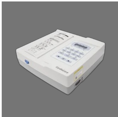
Bionet Cardiocare 2000 12-Channel ECG Machine