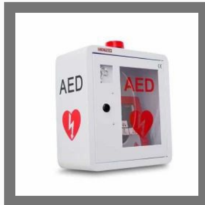
AED Defibrillator Cabinet With Alarm