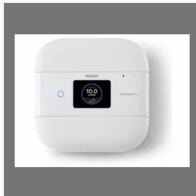
Philips Respironics DreamStation Go Travel Auto CPAP