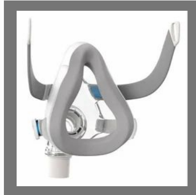
Resmed AirTouch F20 Full Face Mask