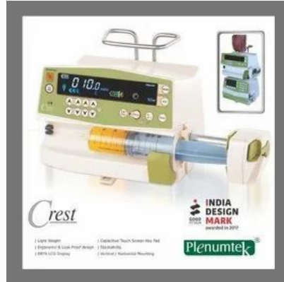
Plenumtech Crest Syringe Pump