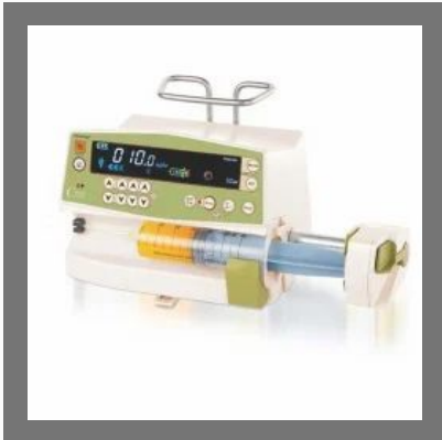
Plenumtech Crest Syringe Pump