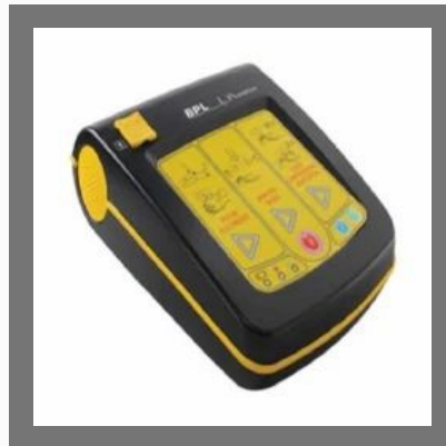
BPL Phoenix DF2628 AED Defibrillator