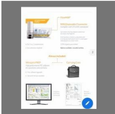
Mir Spirolab Spirometer PFT