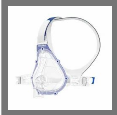
Resmed AcuCare F1-4 Hospital Vented Full Face Mask