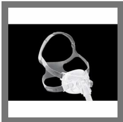
Philips Respironics Amara View Minimal Contact Full Face Mask