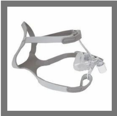
Philips PICO Nasal Mask