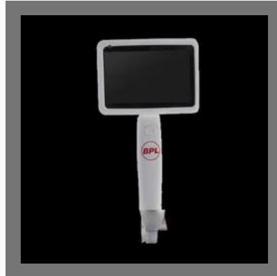
BPL Video Laryngoscope