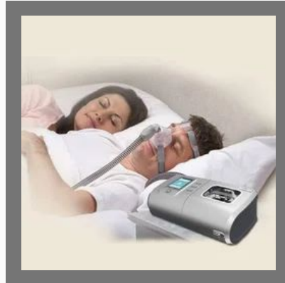
VentMed DS8 BiPAP ST30 with Humidifier