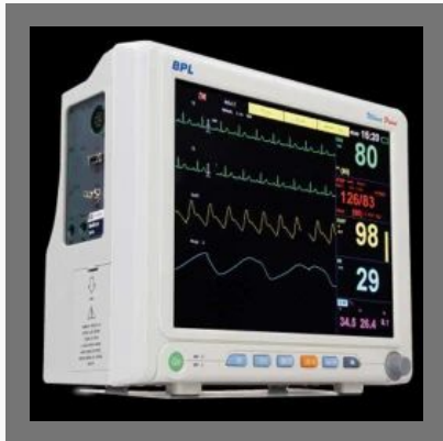
BPL Ultima Prime 12.1inch Patient Monitor (Digital, Masimo or Nellcor)