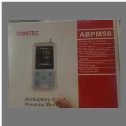
Contec Ambulatory Bp Monitor Abpm50