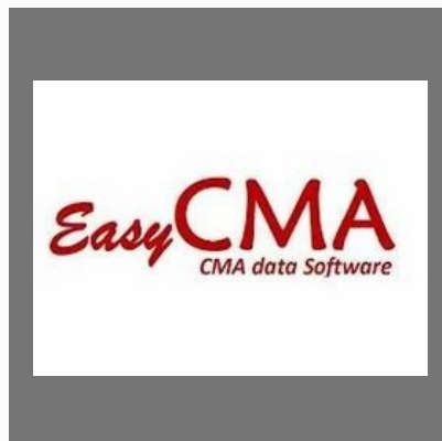
Cma Data Services