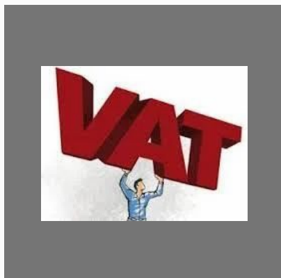
D Vat & Cst Services