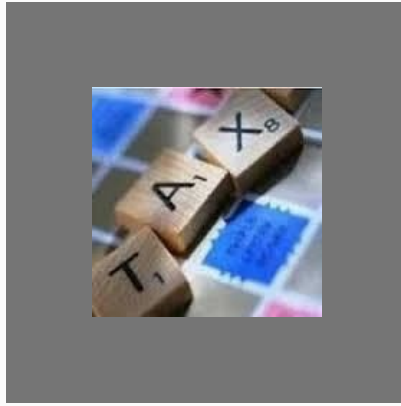
Direct Tax Matters Services