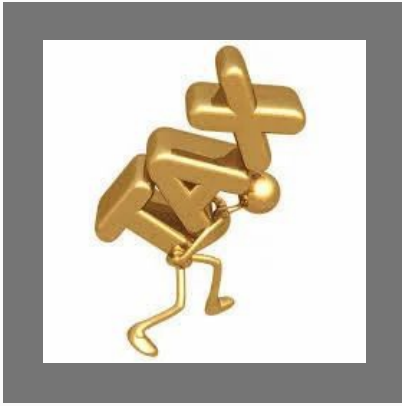
Tax Planning Services