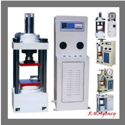
Concrete testing Machines