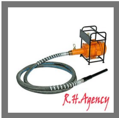
Concrete Needle Vibrator