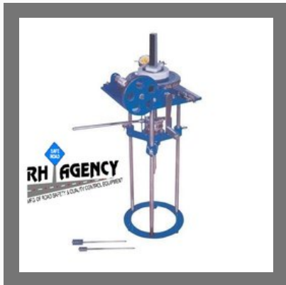
Vane Shear Apparatus