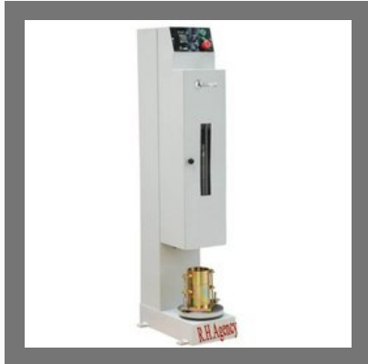
Universal Automatic Compactor Machine