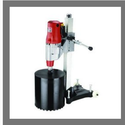
Core Drill Machine