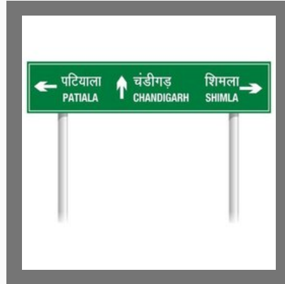
Gantry Sign Board