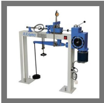
Direct Shear Test Apparatus