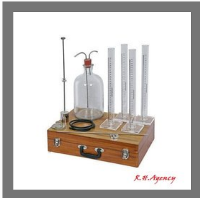
Sand Equivalent Apparatus