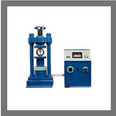
Compression Testing Machine With Digital Readout Unit