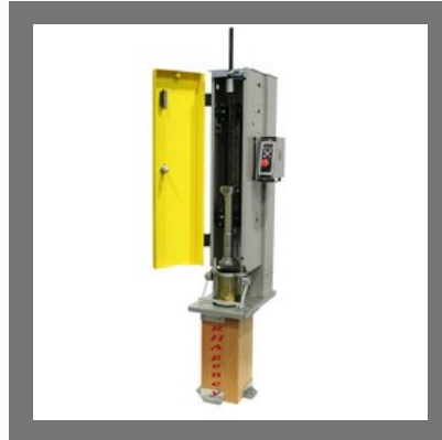
Automatic Marshall compactors Machine