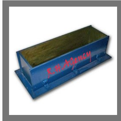
Beam Moulds & Cube Moulds