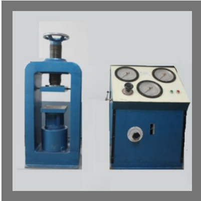
Compression Testing Machine With Three Gauge