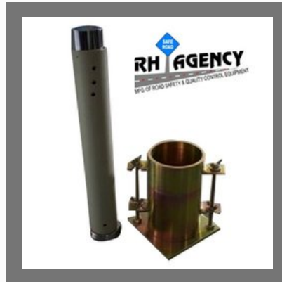
Proctor Compaction Test Apparatus