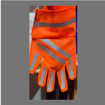
Reflective Hand Gloves