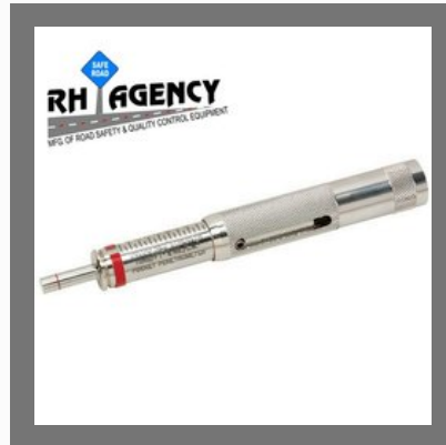
Pocket Penetrometer Test