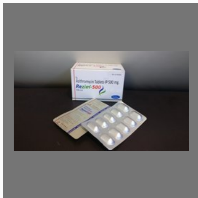
Rezim-500 (Azithromycin tablets I.P 500 mg)