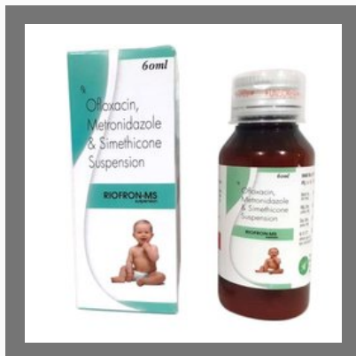
Riofron MS Syrup