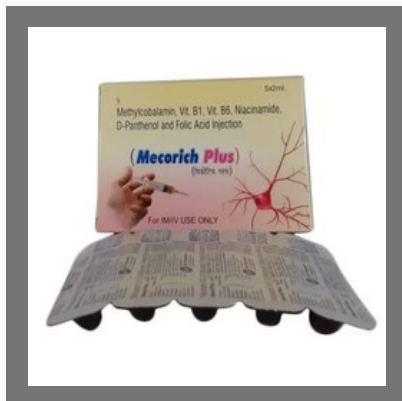
Mecorich Plus Injection