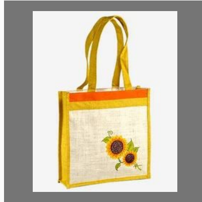
Printed Bags(1070 D)