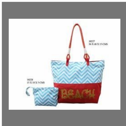
Wavy Pouch Beach Bags 10228