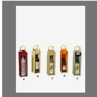
Wine Bottle Bags(Single Bottle Bags)