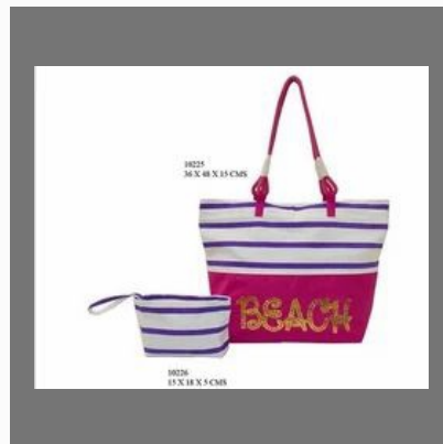
Maldives Pouch Beach Bags 10266