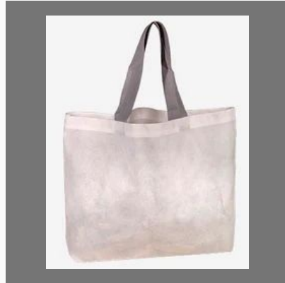
Cotton & Non Woven Bags