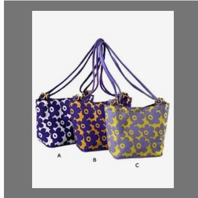
Printed Bags(6011 A-C)