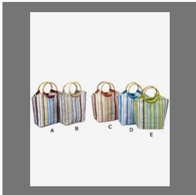
Bags With Printed Stripes(1068)