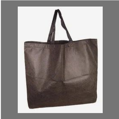
Cotton & Non Woven Bags