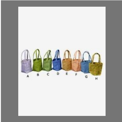
Printed Bags(6023 A-H)