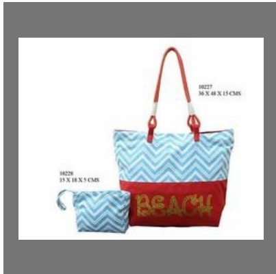
Wavy Tote Beach Bags 10227