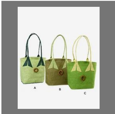
Fashion Bags (6013 A-C)