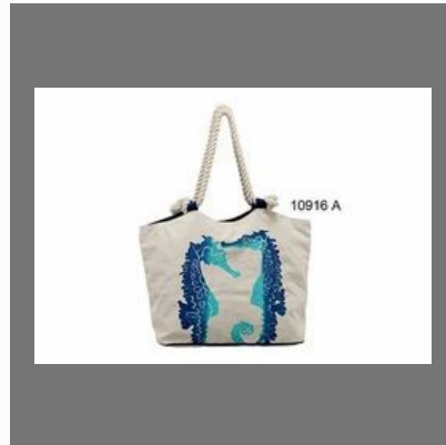
10916A Cotton Beach Bags