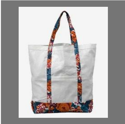
Cotton & Non Woven Bags