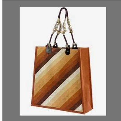
Bags With Printed Stripes(6019)