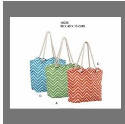
Chevron Beach Bags 10055