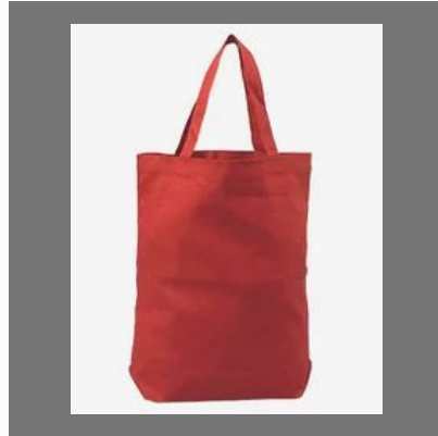
Cotton & Non Woven Bags