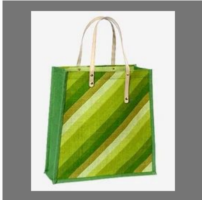
Bags With Printed Stripes(6033)