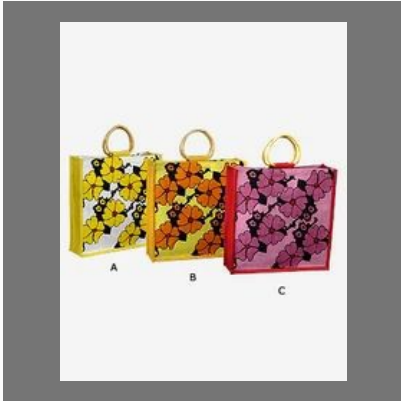
Printed Bags(6032 A-C)