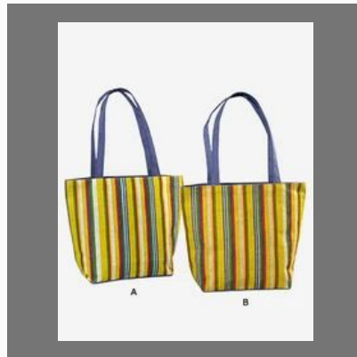
Bags With Printed Stripes(6031 A-B)