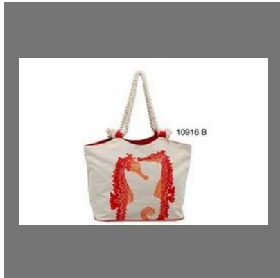
10916B Cotton Beach Bags