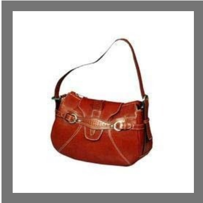
PU Casual Bags