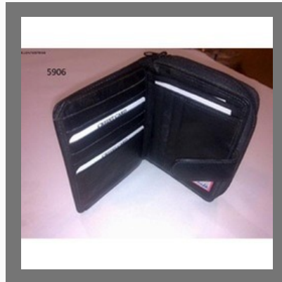
Gents Leather Wallets