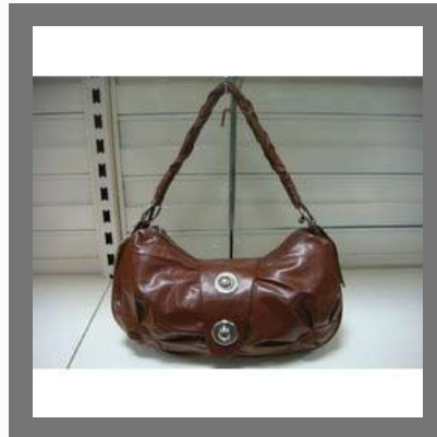
Elegant Ladies Bags