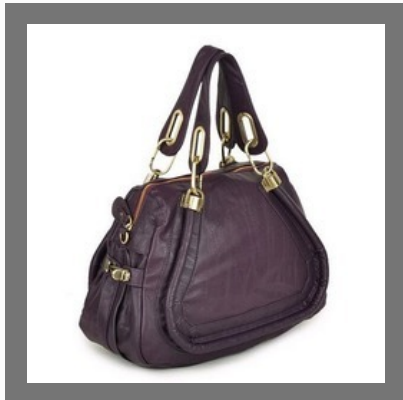
Fashion Polo Handbags