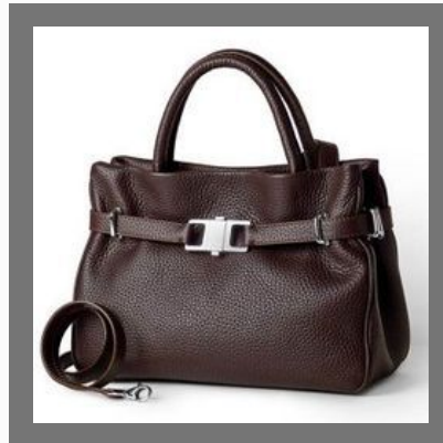
Pure Leather Bags