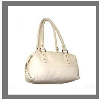
Ladies Fancy Bags