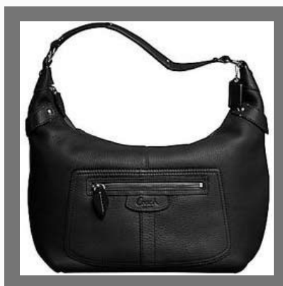
Rope Handle Bags