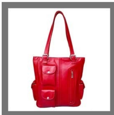
Long Framed Top Handle Bags