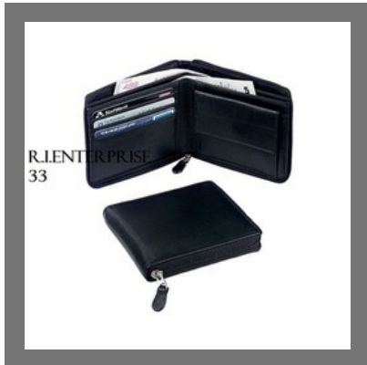
Multi Compartment Wallets