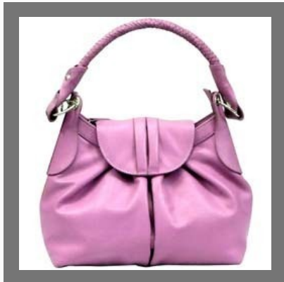
Fancy Leather Handbags