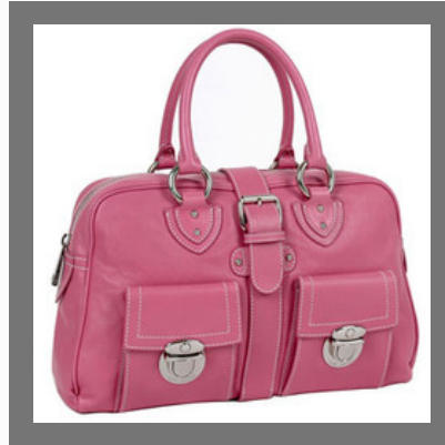
Designer Top Handle Bags