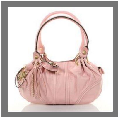
Trendy Leather Bags