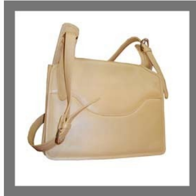
Long Strap Shoulder Bags