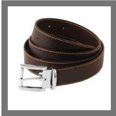
Mens Leather Belts