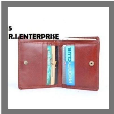
Trifold Leather Wallets