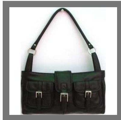
Ladies Fashion Bags