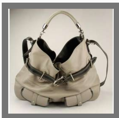
Stylish Women Handbags