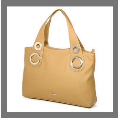
Classic Women Bags