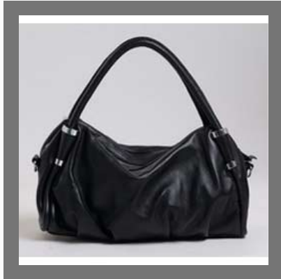
Design Leather Handbags