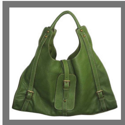
Green Hobo Bags