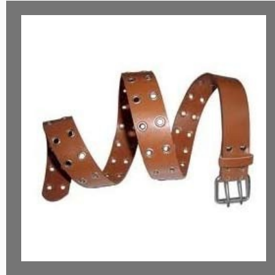
Ladies Leather Belts