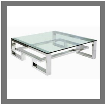
SS Center Table