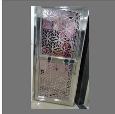
Stainless Steel Laser cutting Safety door