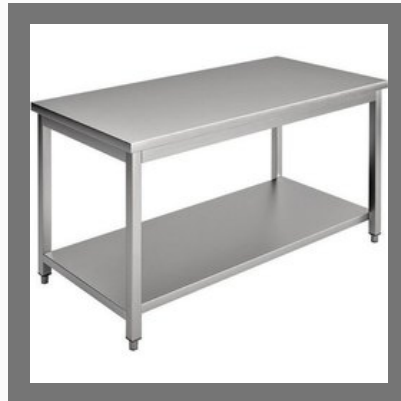
SS Work Table