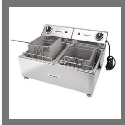
Commercial Frying Equipment