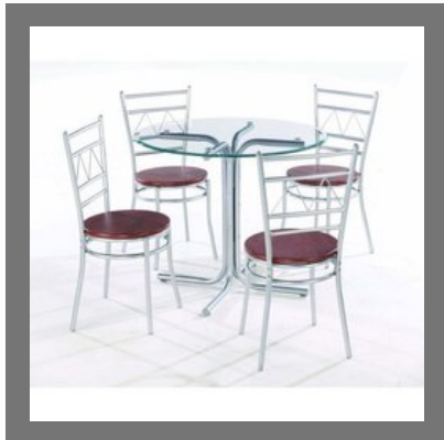
Stainless Steel Chair