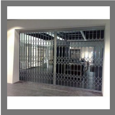
SS Collapsible Gate