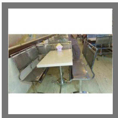
Restaurant Table With Chair