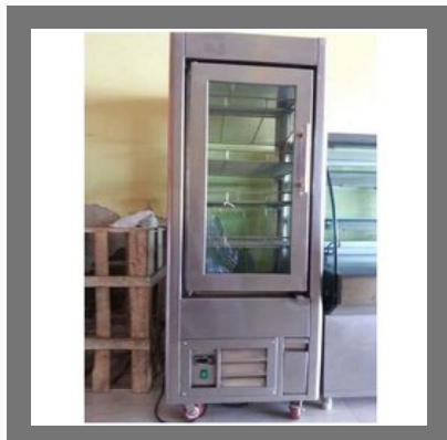
Cake Display Vertical Fridge