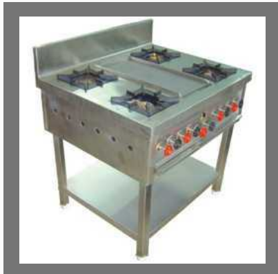
Continental Four Burner Bhatti