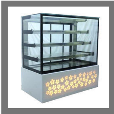
SS Service Counter