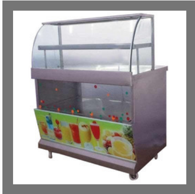
SS Juice Counter