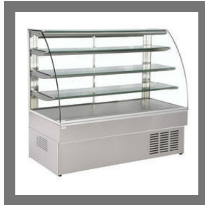
SS Cake Display Counter