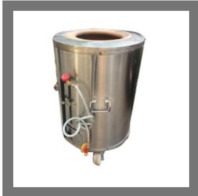
Round Gas Tandoor Bhatti