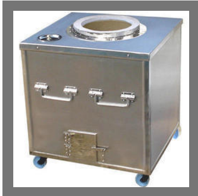
SS Tandoor Trolley