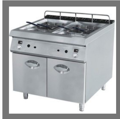
Double Basket Deep Fryer