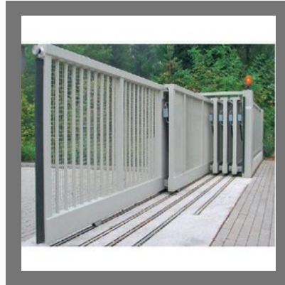
Laser Cut MS Powder Coating Sliding Gate