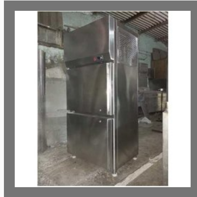
Three Door Vertical Fridge