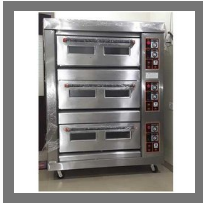
SS Industrial Bakery Oven