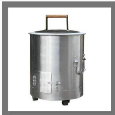
SS Tandoor Pot