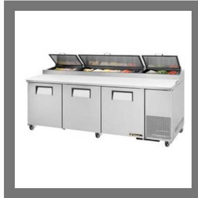
SS Juice Sandwich Pizza Counter