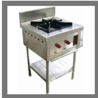
Single Burner Bhatti