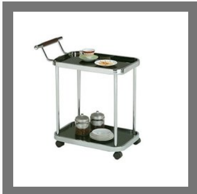
Room Service Trolley