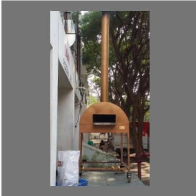
Wood Fired Pizza Oven