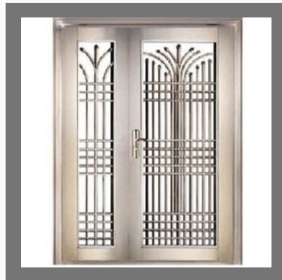
Insulation Access Door