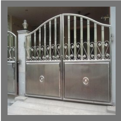
Stainless Steel Gate