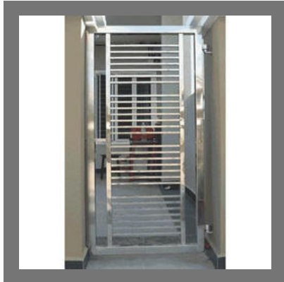
Stainless Steel Doors