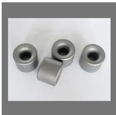
T.C. Wire Drawing Dies