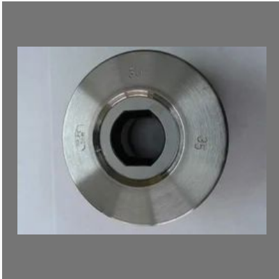
Wire Drawing Dies