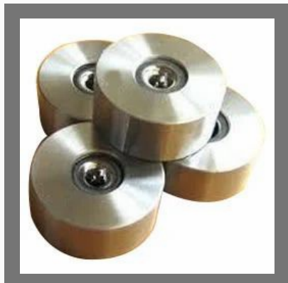
Wire Drawing Dies