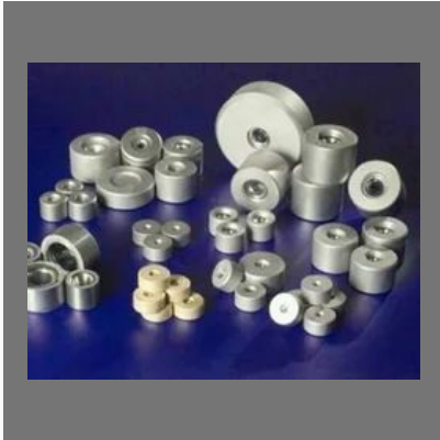
Tungsten Carbide Wire Drawing Die