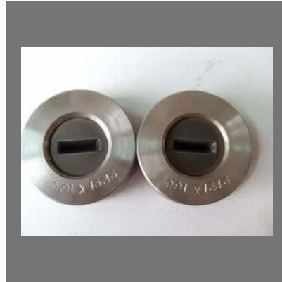
Flat Bar Drawing Dies