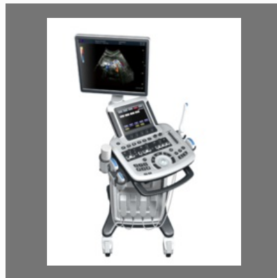
Color Doppler Ultrasound Machine Model UScan D G76