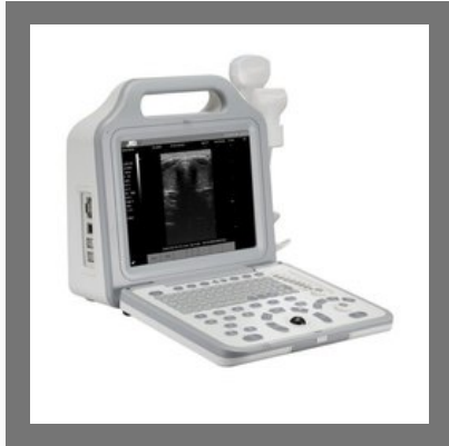
Fully Digital Ultrasound System UScan N2