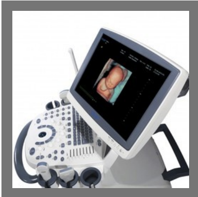
Diagnostic Color Doppler Ultrasound System Model UScan D G70