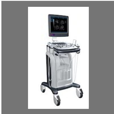
Ultrasound Scanner UScan 2800 Plus