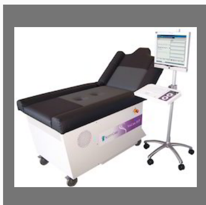
Via Care USFDA Approved ECP Device