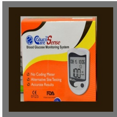
Gluco Care Sense Glucose Meter