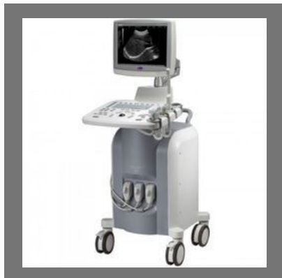
Diagnostic Ultrasound Machines UScan 2800