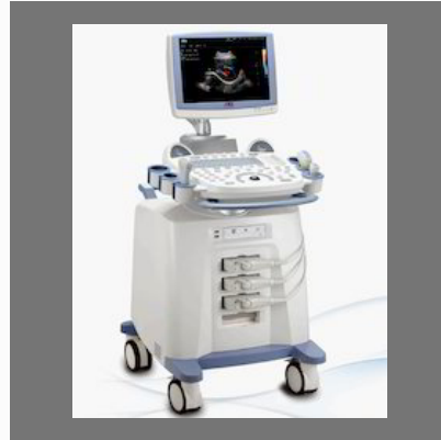
Color Doppler Diagnostic Ultrasound System Model UScan D G70