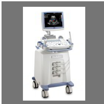
Ultrasound Machine UScan D 3000 Plus