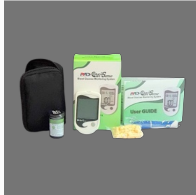
GlucoCare Sense Complete Kit