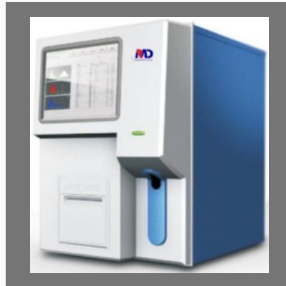
Automatic Hematology Analyzer