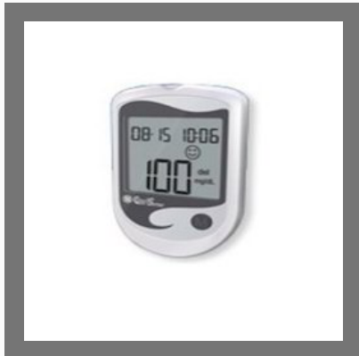
Glucose Testing (Blood Sugar) Glucometer