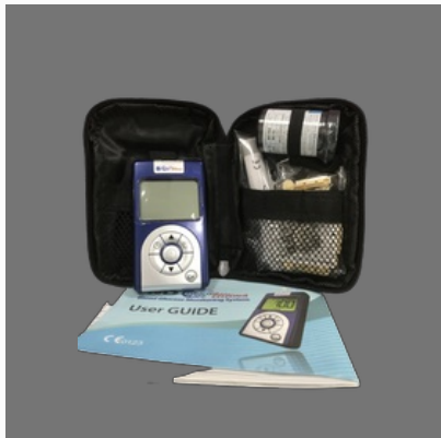
GlucoCare Ultima Glucose Meter