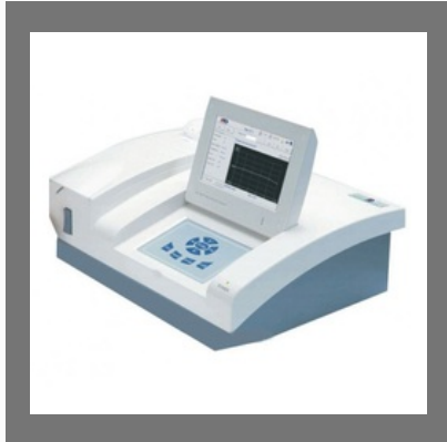
Clinical Chemistry Analyzers