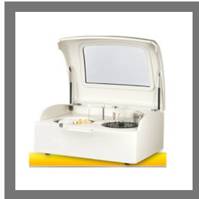
Fully Automatic Chemistry Analyzer