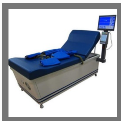
ECP INTEGRA External Counter Pulsation Device