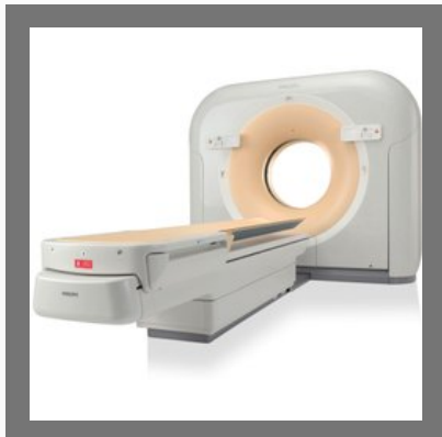
Refurbished Philips CT Scan Machine