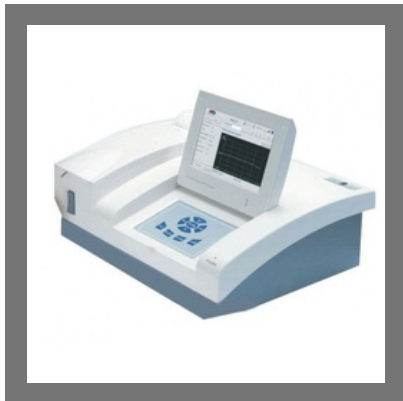
Semi Automatic Clinical Chemistry Analyzer