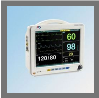
Multi Para Patient Monitor