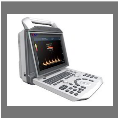
Ultrasound Color Doppler Model UScan D G30