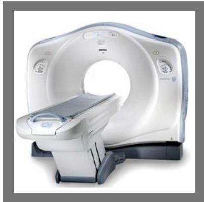
Refurbished GE CT Scan Machine