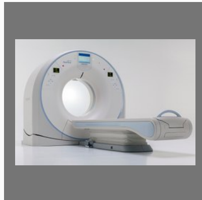
Refurbished Toshiba CT Scan Machine