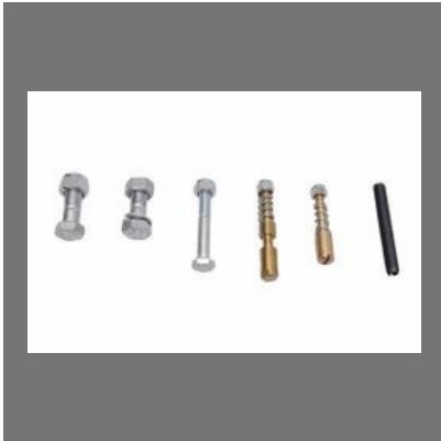
Push Pin For Agriculture Machine Parts