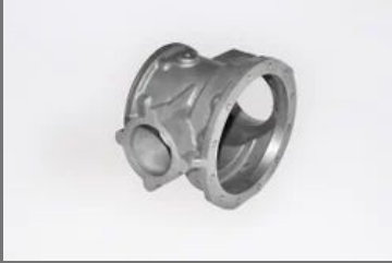
Single Speed Gearbox Body (ROTAVATOR SPARE-PART)