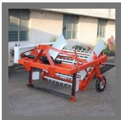
Groundnut Peanut Digger