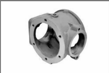
Regular Single Speed Gearbox Body for Shaktiman Rotavator Regular 540RPM