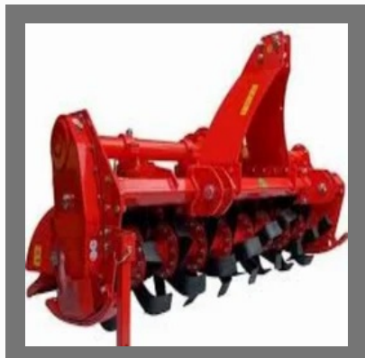
Multi Speed Rotavator