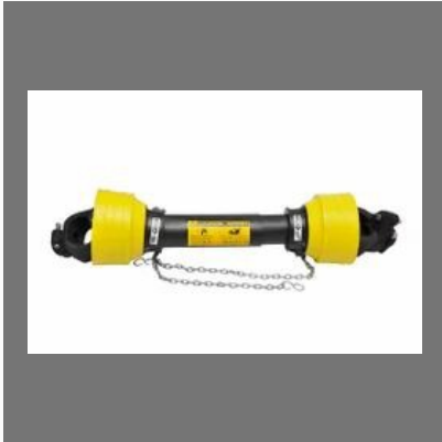
Rotavator Pto Shaft