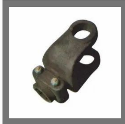
Shaktiman 6 Spline Plain Yoke for Rotavator