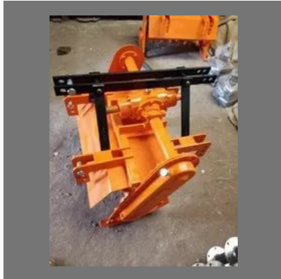
Reverse Forward Rotavator