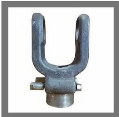
Shaktiman Spline Plain Yoke for Rotavator