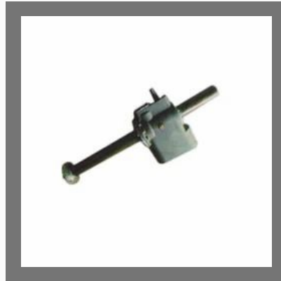
Rotavator Gear Box