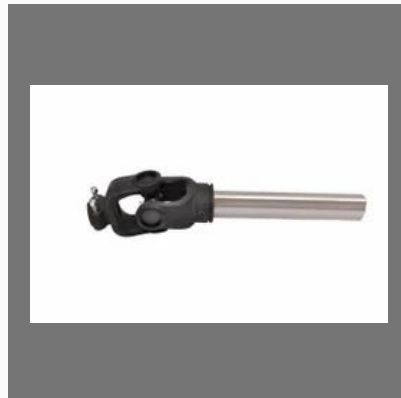
Tractor Side PTO