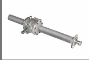
Single Speed Gear Box