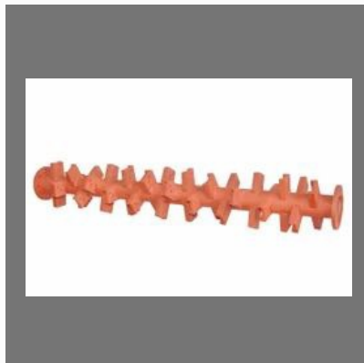
Spyke Roter for Rotavator