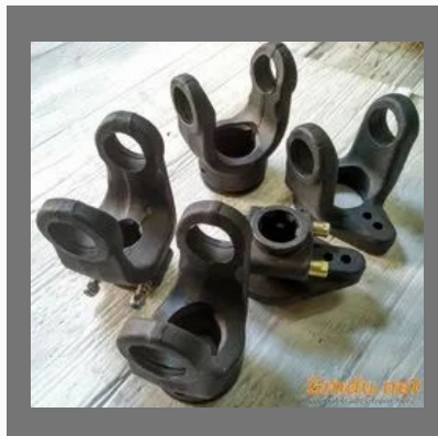
Hub With Push Pin