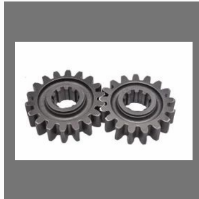
S.Speed Gear Set