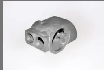
Multi Speed Gearbox Body