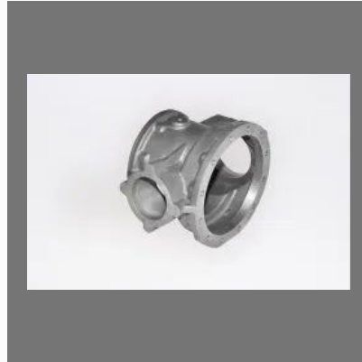
SHAKTIMAN ROTAVATOR Single Speed Gearbox Body