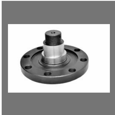
S.Stub Axel Shaft