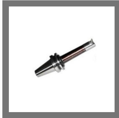
Micro Boring Adaptor