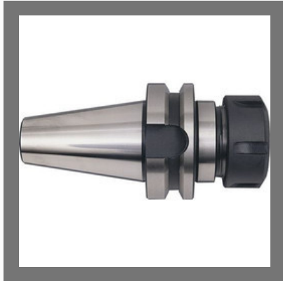
ER Collet Chuck Adaptor