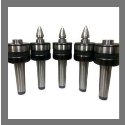
CNC Revolving Centers