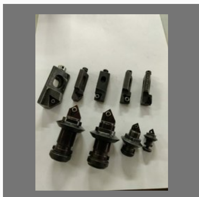
Micro Boring Cartridges