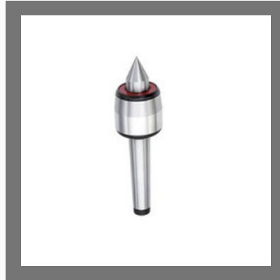
CNC Revolving Centers