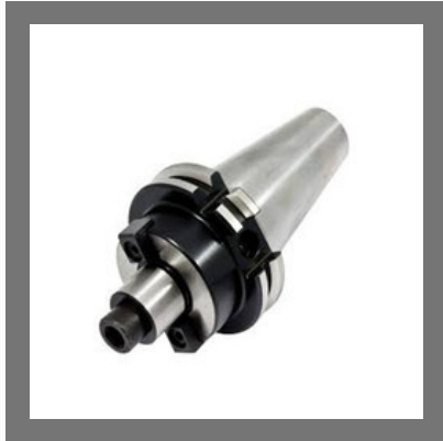
Face Mill Arbor