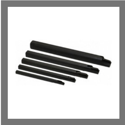
Indexable Boring Bars