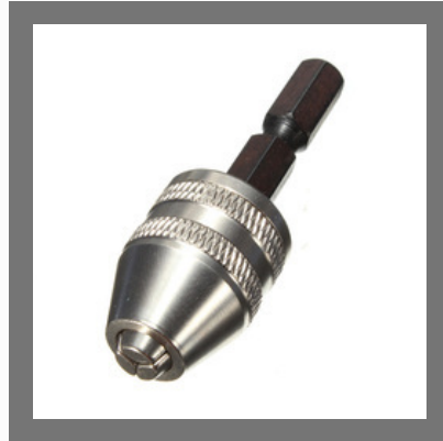
Keyless Drill Chuck Adaptor