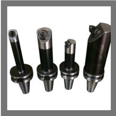
BCA Finish Boring Bar