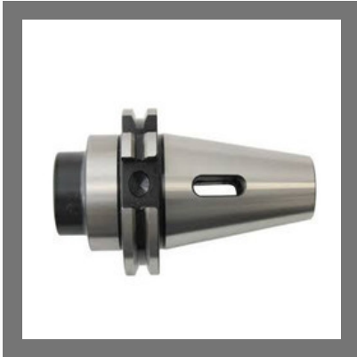
Morse Taper Adaptor