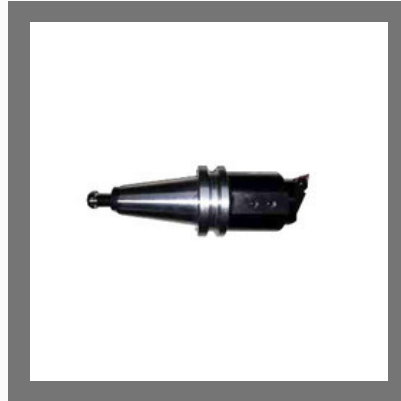
Finish Boring Bars