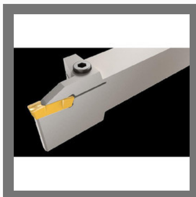
CNC Grooving Tools