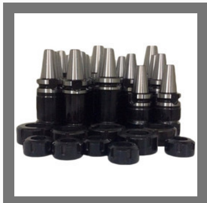
ER Collet Chuck