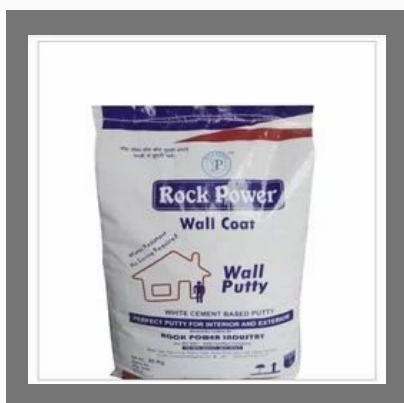
Rock Power (Wall Coat) Wall Putty