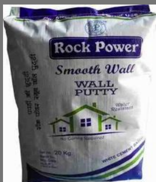
Rock Power Smooth Wall