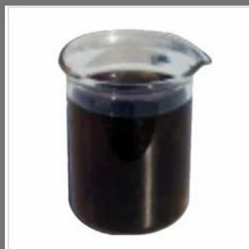
Liquid Waterproofing ( LWP )