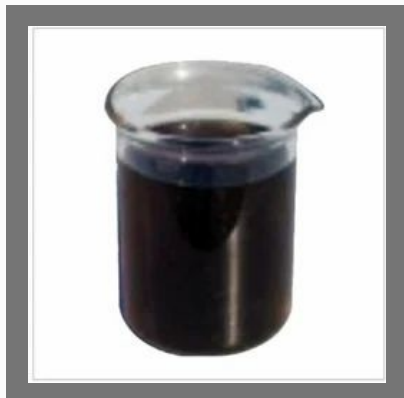
Paving Block Admixture ( PLAST-SUPER )