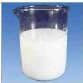
Liquid Water Proofing ( ROCK CRETE )