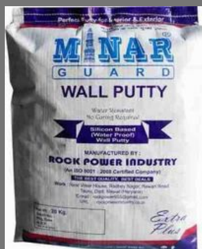
Minar Guard Wall Putty