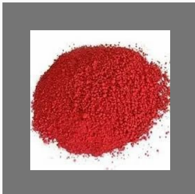
Red Iron Oxide