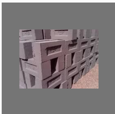
Fly Ash Bricks Admixture