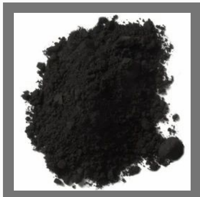
Black Iron Oxide