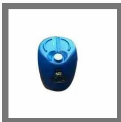
Paving Block Lacquer Coating ( Shine Coat )