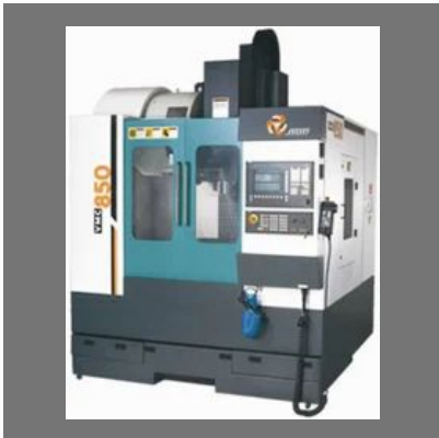
Mechanical Power Press