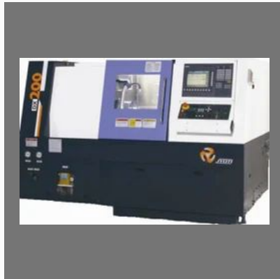
Friction Belt Drop Hammer