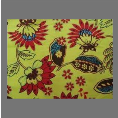
Woven Printed Fabric