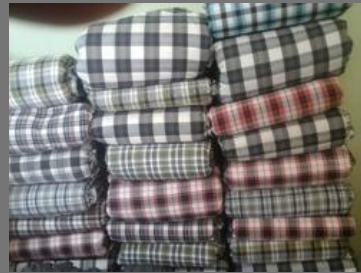
Yarn Dyed Woven Fabric