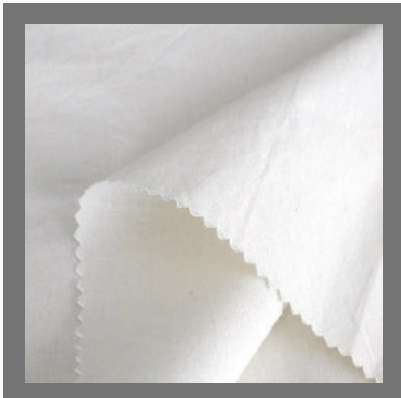
Cotton Cambric Fabric