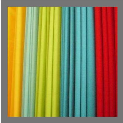
Nylon Mesh Fabric