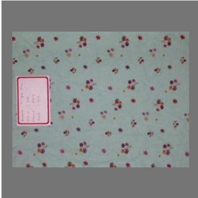
Flannel Print Fabric