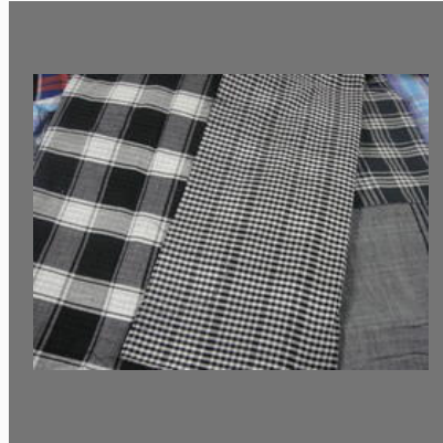
Double Sided Fabric