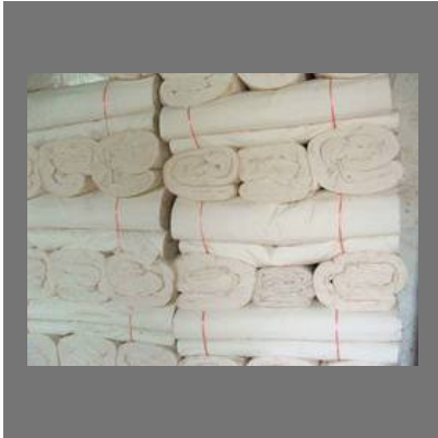
Cotton Grey Fabric