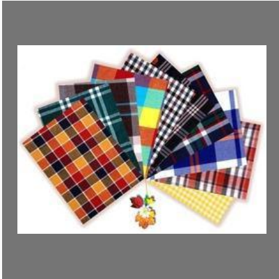
Yarn Dyed Stripe Fabric