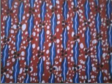
African Printed Fabric