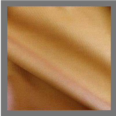
Organic Cotton Fabric