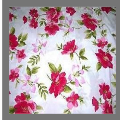
Flower Printed Fabric