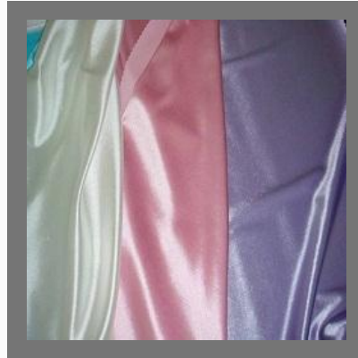
Nylon Silk Fabric