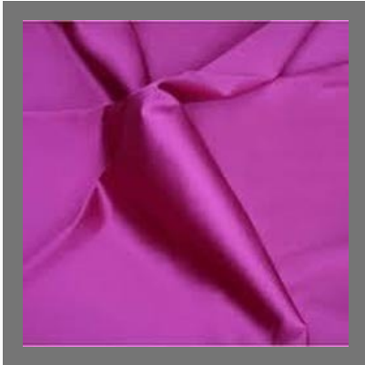
Nylon Satin Fabric