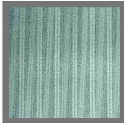
Cotton Dobby Fabric