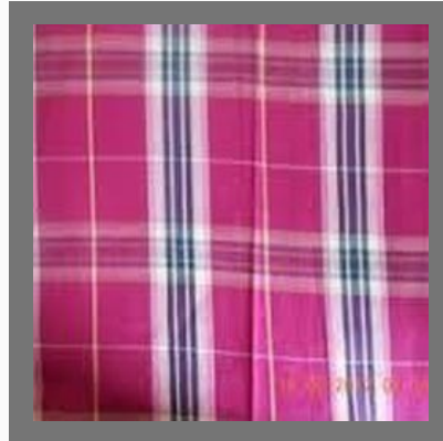
Cotton Yarn Dyed Fabric