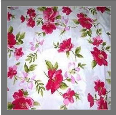
Cotton Printed Fabric