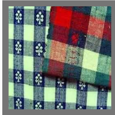
Yarn Dyed Dobby Fabric