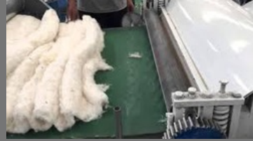
Waste Recycling Cotton