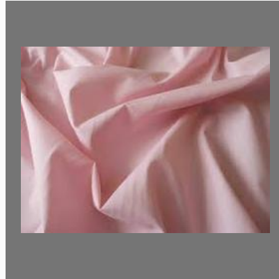
Cotton Polyester Fabric