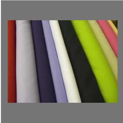
Woven Dyed Fabric