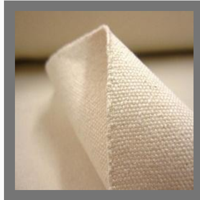
Cotton Duck Fabric