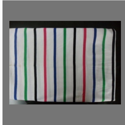
Yarn Dyed Stripe Fabric