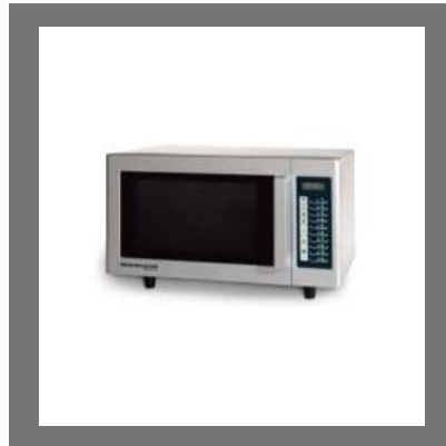
Commercial Microwave Ovens