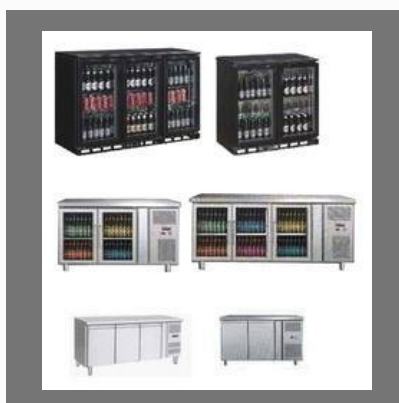
Under Counter & Back Bars