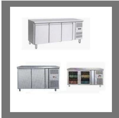
Under Counter Freezers