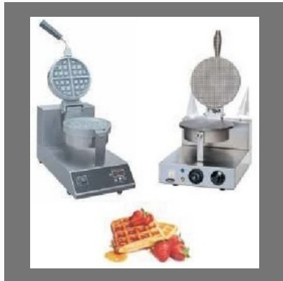
Waffle Irons and Cone Bakers