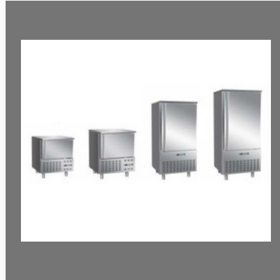
Blast Chillers & Shock Freezers