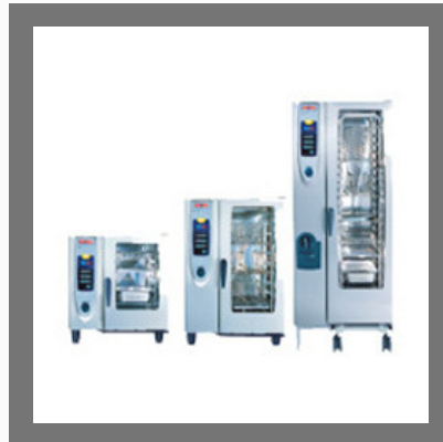
Self Cooking Center