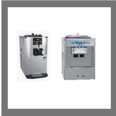
Soft Serve Ice Cream Machines