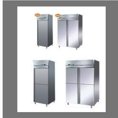
Reach in Freezers