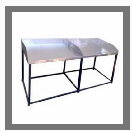
Cashew Grading Table