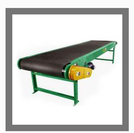
Cashew Nut Conveyor