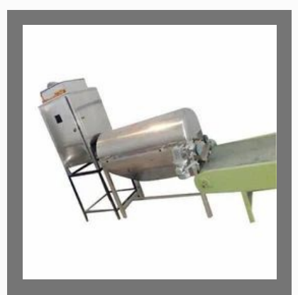
Automatic Peeling Machine