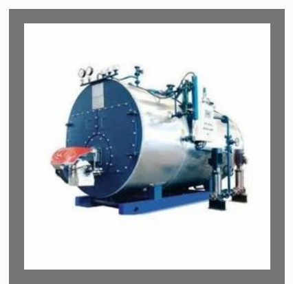
IBR Type Cashew Nut Boiler