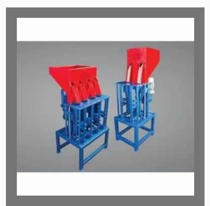
Automatic Cashew Nut Cutting Machine