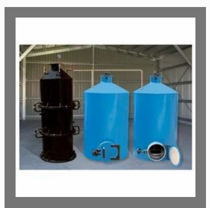
Non-IBR Type Cashewnut Boiler