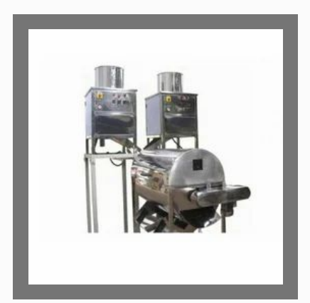
Automatic Cashew Nut Peeling Machine