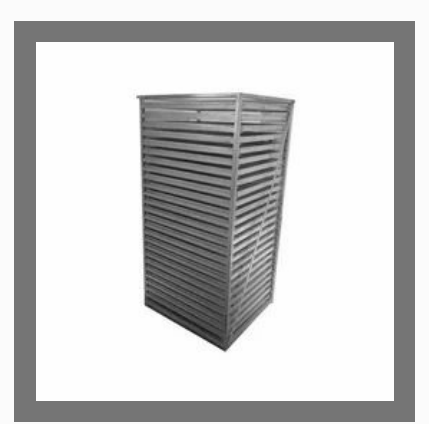
Tray Dryer Trolley