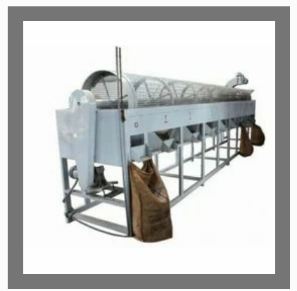
Raw Cashew Nut Grading Machine