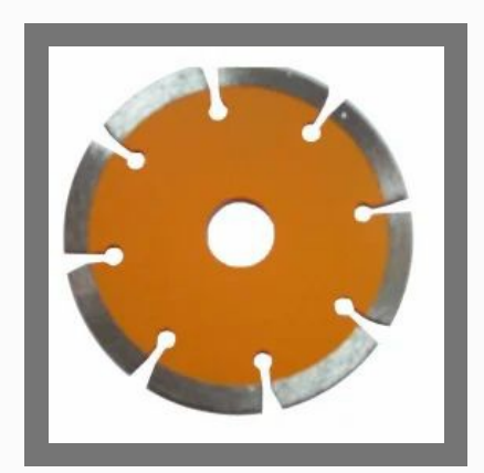
Cutting Machine Blade