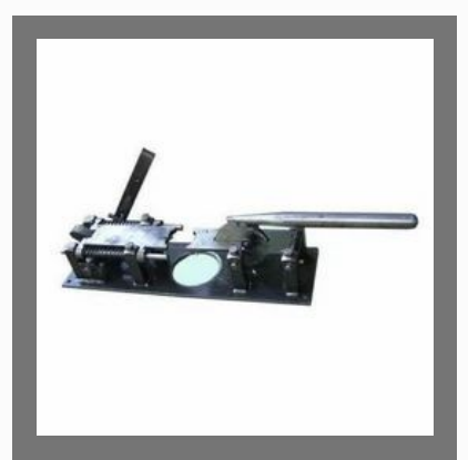
Manual Cashew Nut Cutting Machine