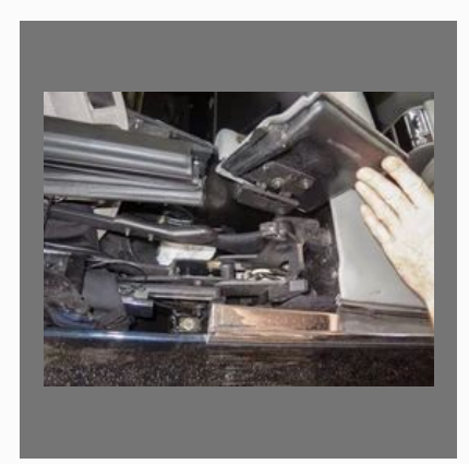
Automatic Peeling Machine Repairing Service