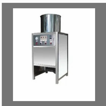
Semi Automatic Cashew Nut Peeling Machine