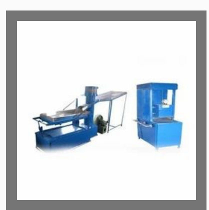
Cashew Tin Filling Machine