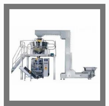
Automatic Cashew Packing Machine