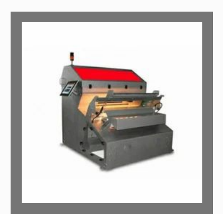
Cashew Color Sorting Machine