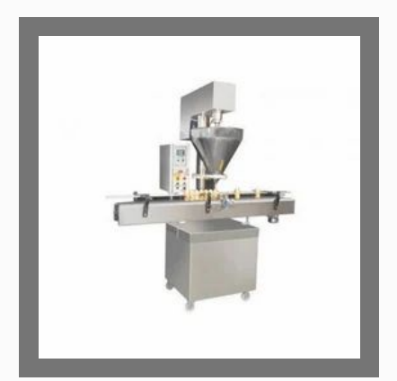
Semi Automatic Cashew Packing Machine