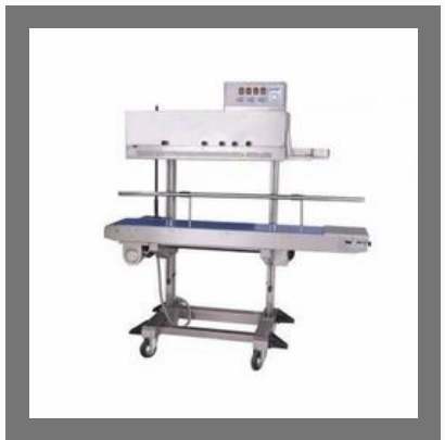
Heavy Duty Continuous Band Sealer