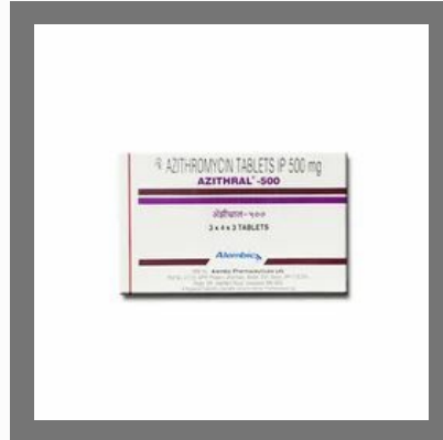
Azithral Tablet 500mg