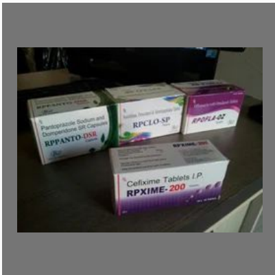
Cefixime 200 Tabs