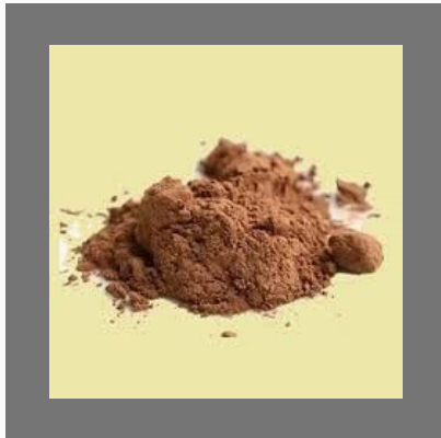
Food Laxative Powder