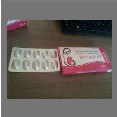
Ferrous Bisglycinate Elemental Iron Tablet 60MG