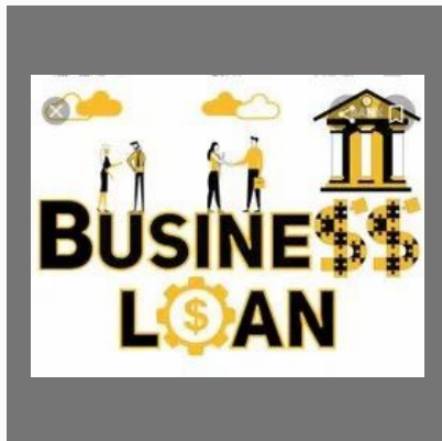
Sme Business Loan