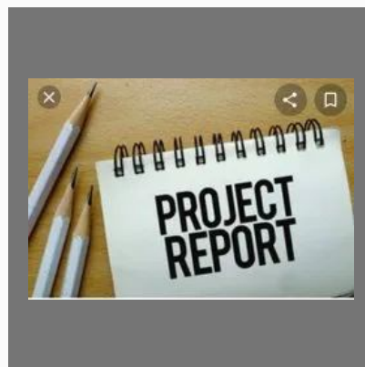
Feasibility Report Services