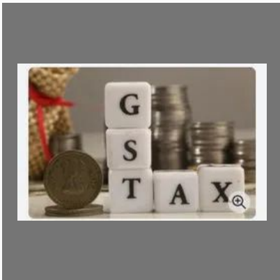
Gst Tax Consultant