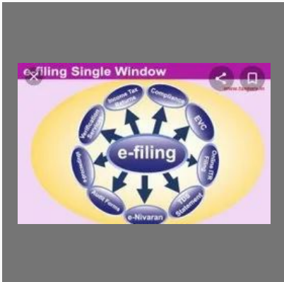
Income Tax Return Services