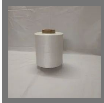
6 Inch 150/48 Nim (tex) SD White Polyester Textured Yarn