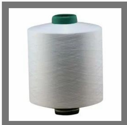
150 LIM SD White Polyester Textured Yarn