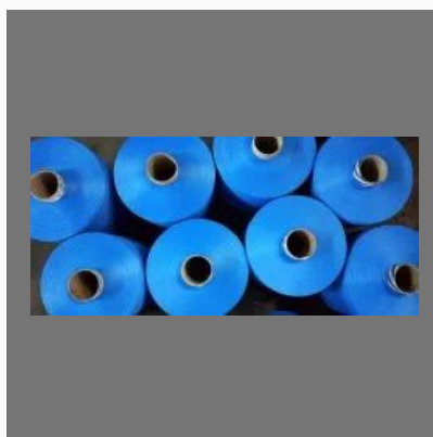
Dyed Polyester Textured Yarn