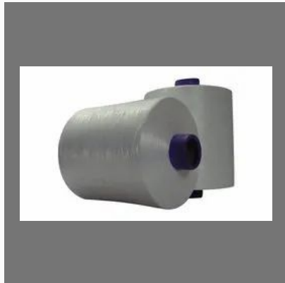
150/108 Micro HIM (ROTO) SD Polyester Textured Yarn