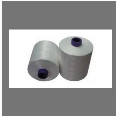
150/48 NIM (TEX) SD White Polyester Textured Yarn