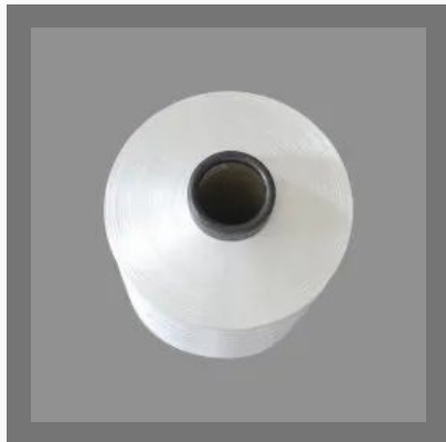
150/48 NIM (TEX) BRT Polyester Textured Yarn