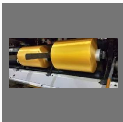
Polyester Cationic Yarns