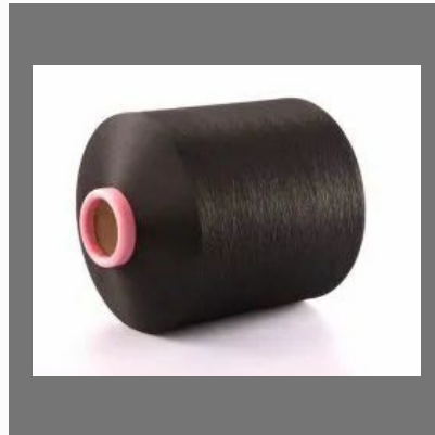
300/96 Black NIM (TEX) Polyester Textured Yarn