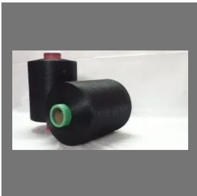
300/96 HIM (ROTO) SD Black Polyester Textured Yarn