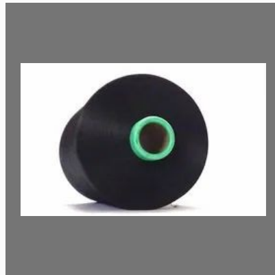
80/72 HIM (ROTO) SD Black Polyester Textured Yarn