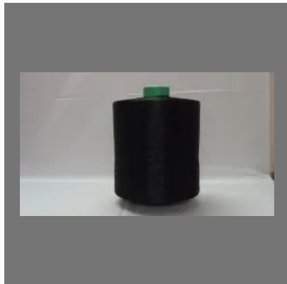
100/36 NIM (TEX) SD Black Polyester Textured Yarn