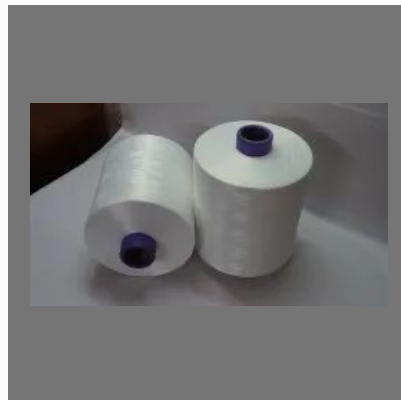
300/96 HIM (ROTO) SD White Polyester Textured Yarn