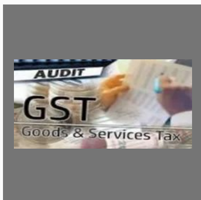
Service Tax Consultants