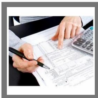
Accounts Preparation Services