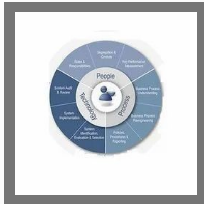
GST Consultant Service