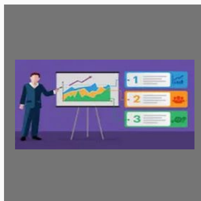
International taxation services