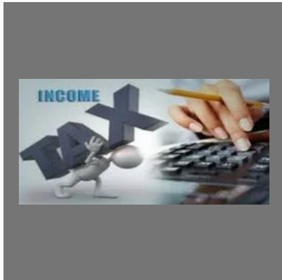
Tax Consultations Opinion