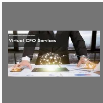
Virtual CFO Services