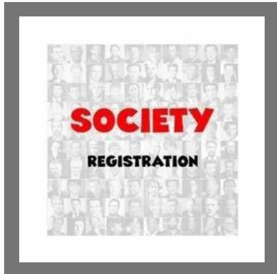
Society Registration Services