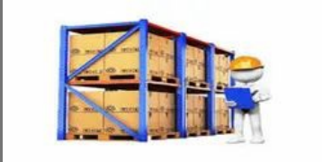
Stock Audit Services