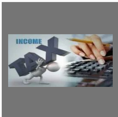
Income Tax Service