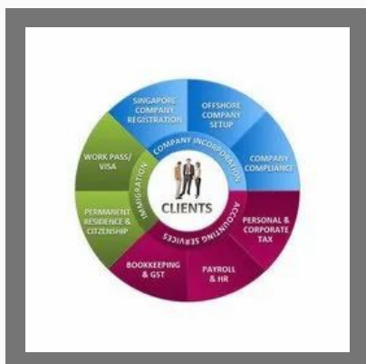
Company Incorporation Service