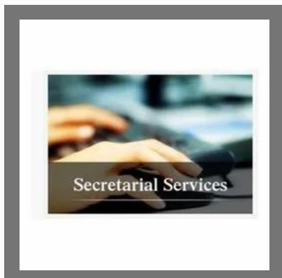
Company Secretaries Services