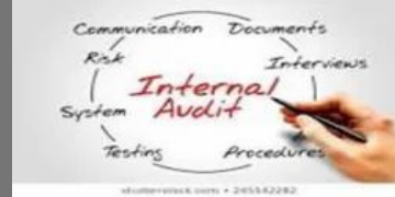
Internal Auditing Services