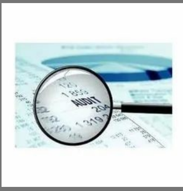
Financial Audit Service