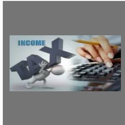
Sales Tax Consultant