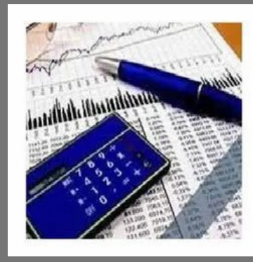
Statutory Audit Service