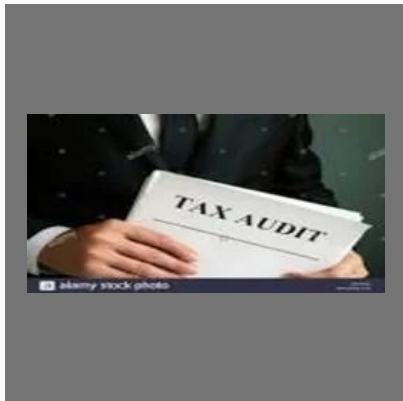
Tax Compliance Service