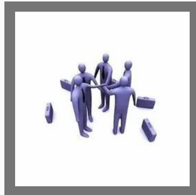
Trust Society Registration