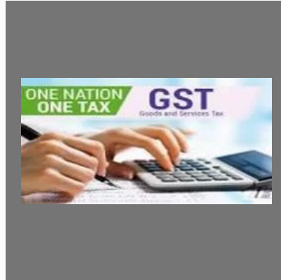
GST Returns Preparation