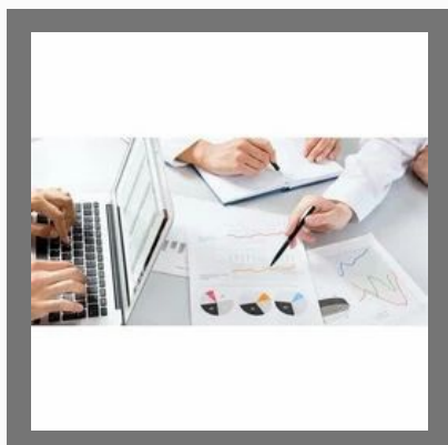
Company Accounting Services