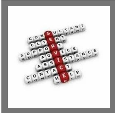
Statutory Returns Filing Service