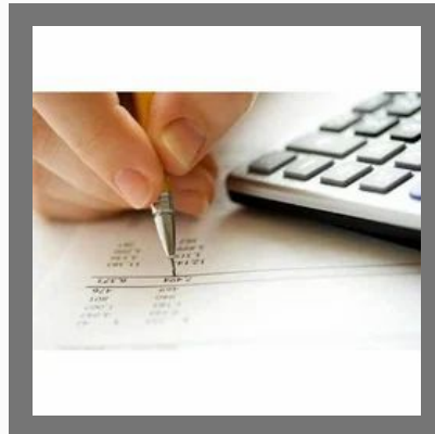
Direct Tax Consulting Services