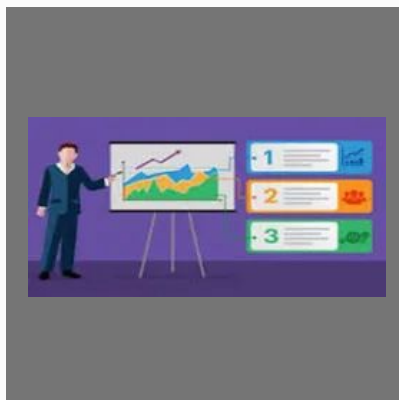
Marketing Audit Service