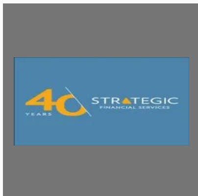
Corporate Financial Consultants