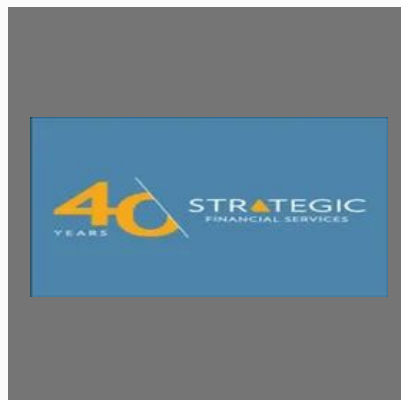
Strategic Financial Services