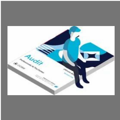
Chartered Accountant Service