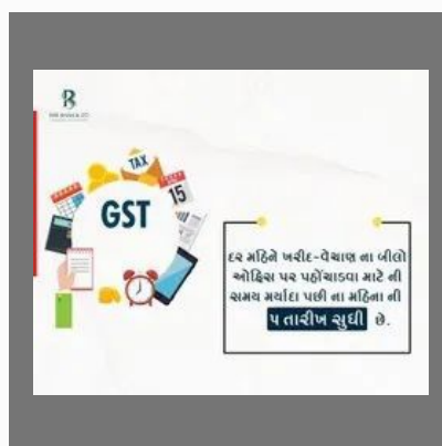
Indirect Tax Service