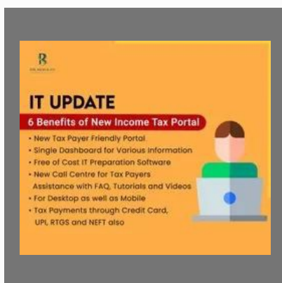
Direct Tax Service