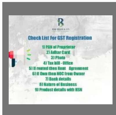
LLC Company Registration Service