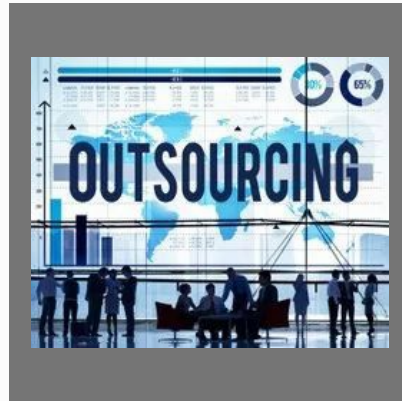
Account Outsourcing Service