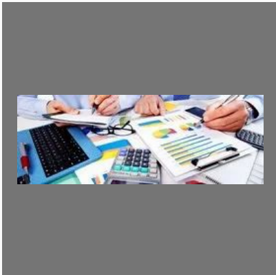
Business Accounting Service