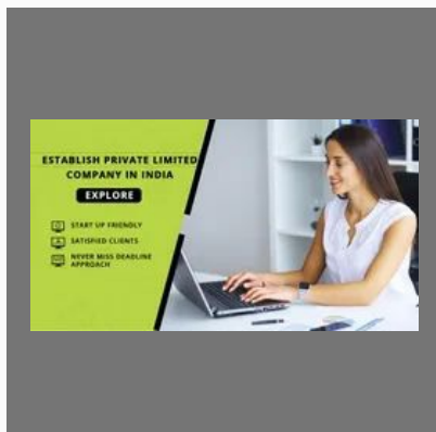
Private Limited Company Registration Service