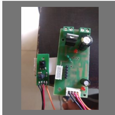
AUTOMATIC HAND SANITIZER CIRCUIT