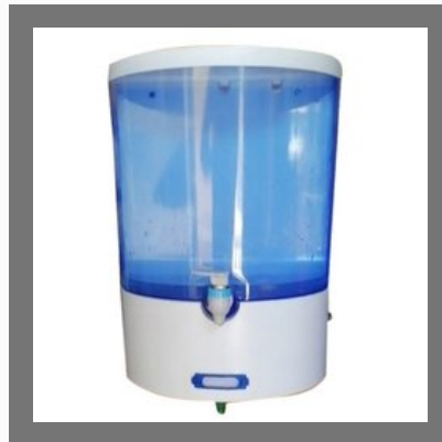
7 L Hand Sanitizer Machine