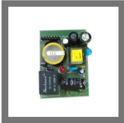
Single Street Light Timer