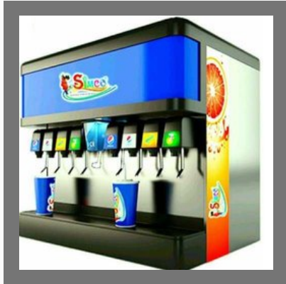
Automatic Soda Fountain Dispenser