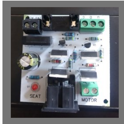
Dc Motor Driver Card