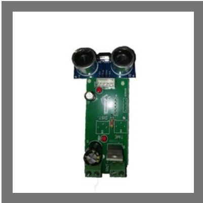
Hand Sanitizer Circuit Board