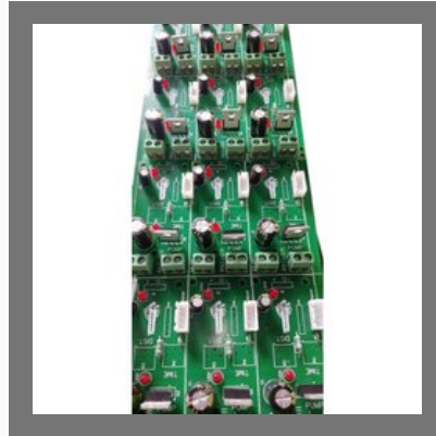
Tunnel Sensor Control Circuit Board