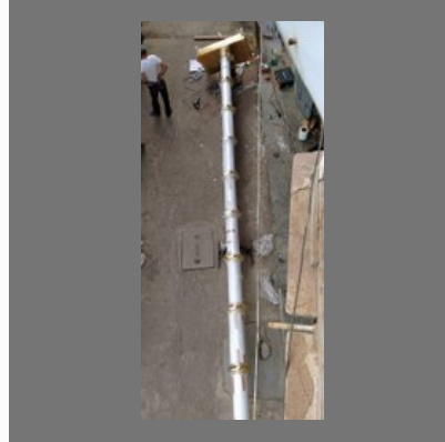
Brass Dhwaja Dand