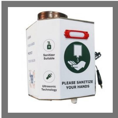
1 L Hand Sanitizer Dispenser