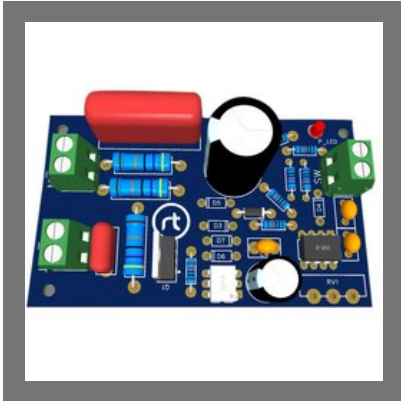
Timer Control PCB Circuit Board