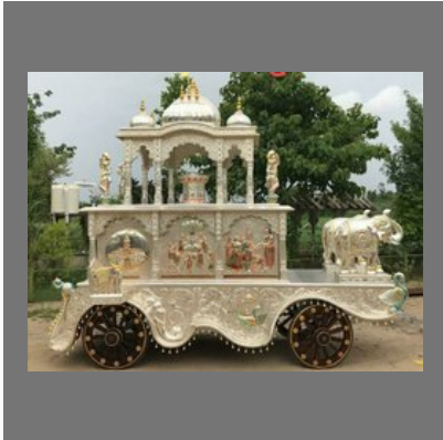
Temple chariot/Silver Rath