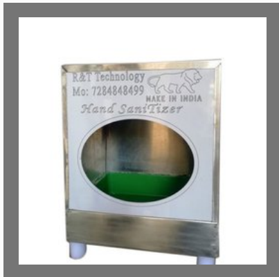
1 L Automatic Hand Sanitizer Dispenser