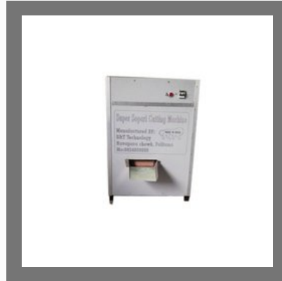
1 HP Supari Cutting Machine