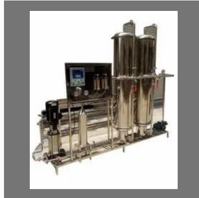
1000 LPH SS RO Plant