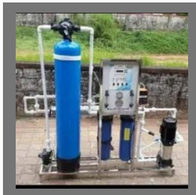
250 LPH RO Plant