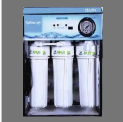
25 LPH Commercial Reverse Osmosis System