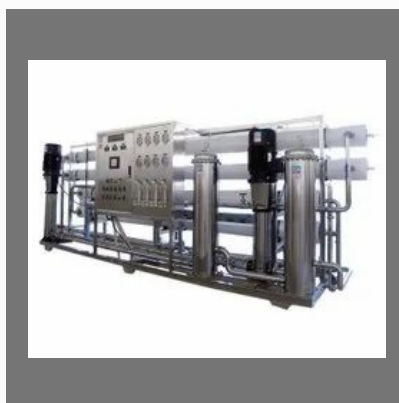
Dialysis RO Plant