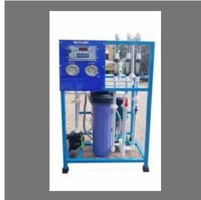
150 LPH Commercial Reverse Osmosis System