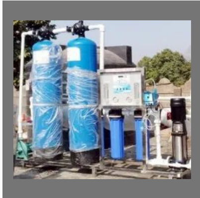
1000 LPH FRP RO Plant