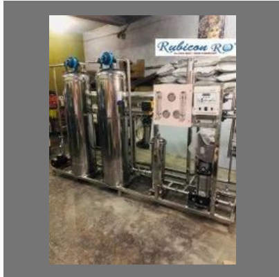
5000 LPH SS RO Plant