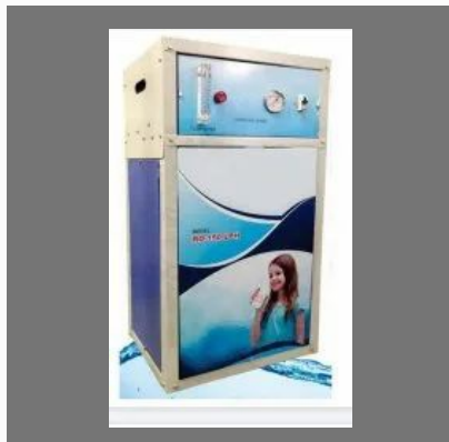
150 LPH Industrial Reverse Osmosis Plant