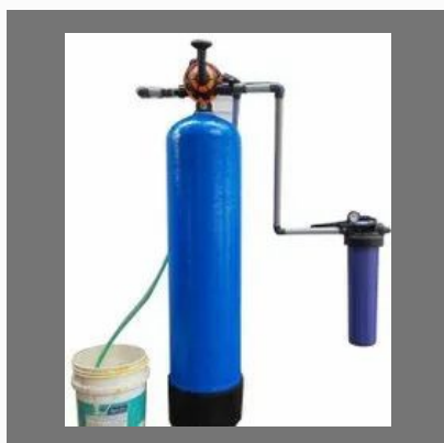
Water Softener Plant