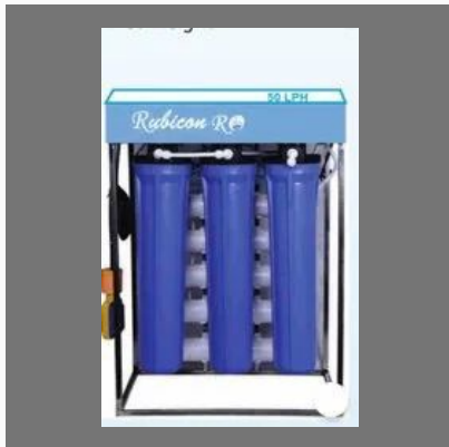
50 LPH Commercial Reverse Osmosis System