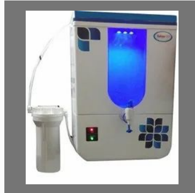
Alkaline Water Purifier