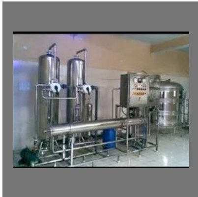
2000 LPH SS RO Plant