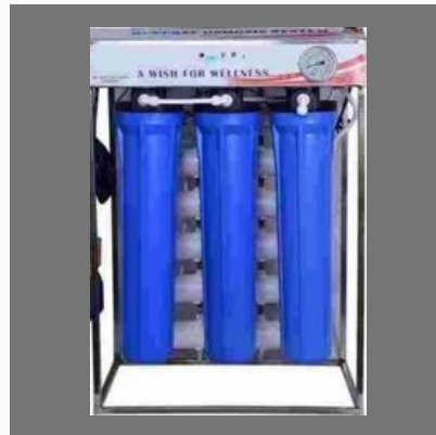
100 LPH Commercial Reverse Osmosis System