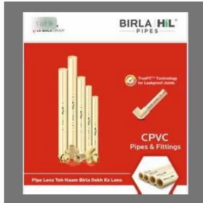
CPVC & UPVC Pipes And Fittings