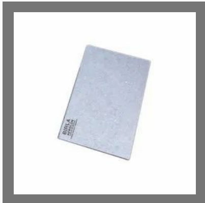
Fibre Cement Board