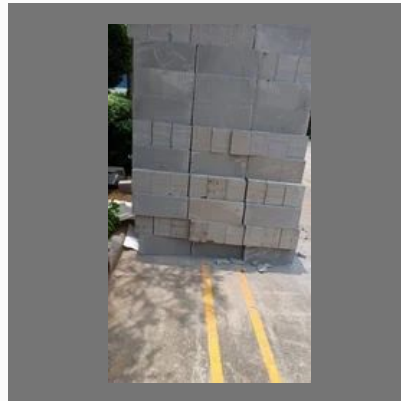
Autoclaved Aerated Concrete Block