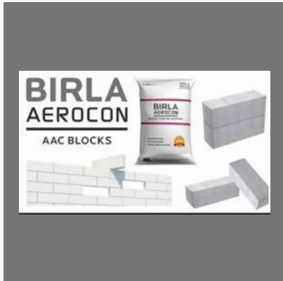
Block Jointing Mortar