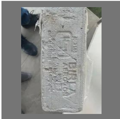
Autoclaved Aerated Concrete Block (AAC Block)