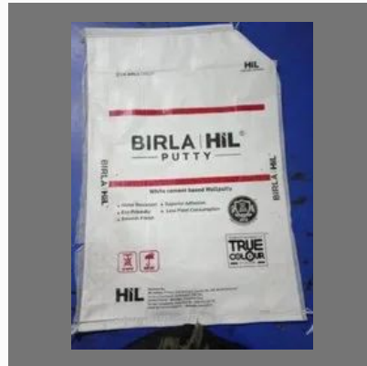
HIL Birla Aerocon Wall Putty