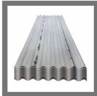
Charminar Cement Sheet