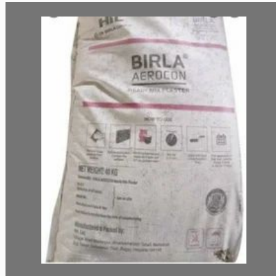
Ready Mix Plaster Bag