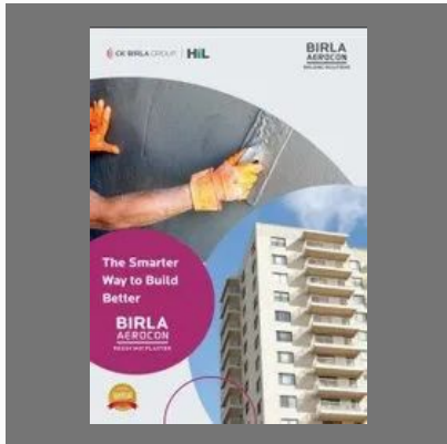
Ready Mix Plaster