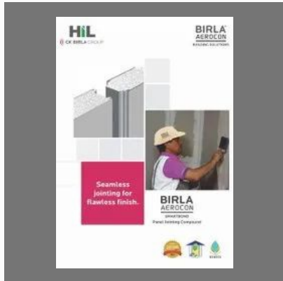
Birla Aerocon Wall Panels