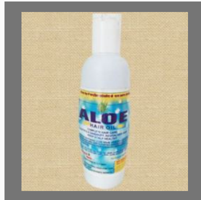
Aloe Hair Oil