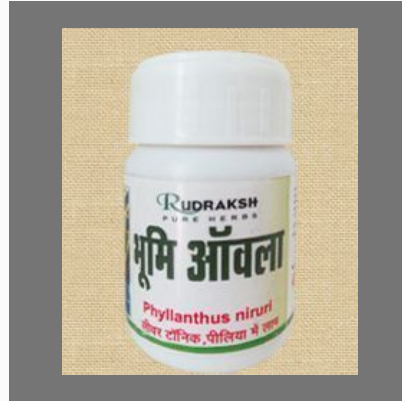
Bhoomi Amla Capsule