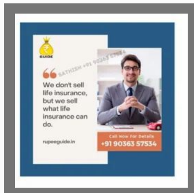
Life Insurance Plan