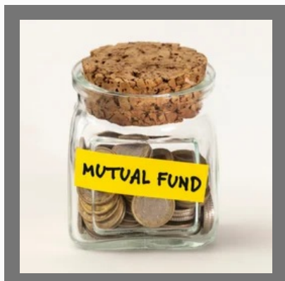
Mutual Fund Consultant