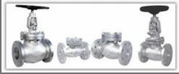
Cast Steel Valves