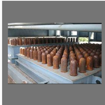
Gas Cutting Nozzle