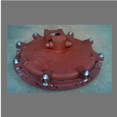
Round Fire Doors