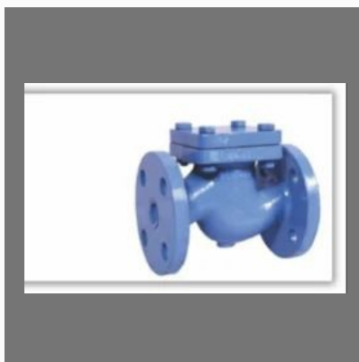
Cast Iron Check Valve