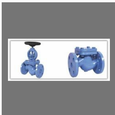
Cast Iron Stop Valves