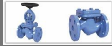
Cast Iron Steam Valve