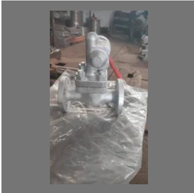
Cast Steel Blowdown Valves