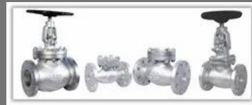
Cast Steel Globe Valves