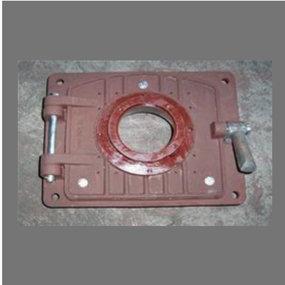
Boiler Furnace Door With Peep Hole