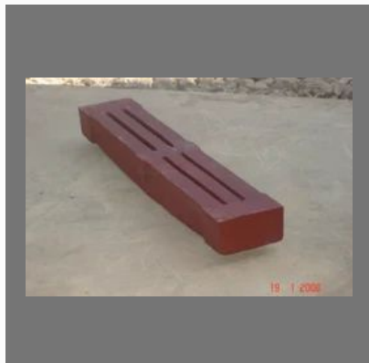
Boiler Fire Bar