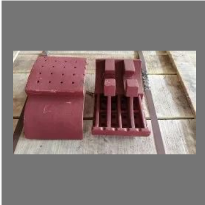
Boiler Grate Casting