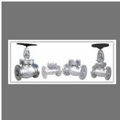
Cast Steel Valve