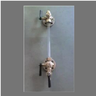
Gauge Glass Valves