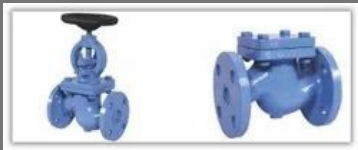
Cast Iron Steam Valves