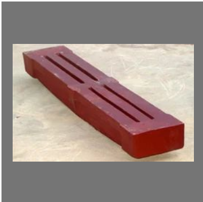
Grate Bar Triplex