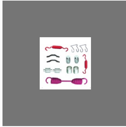
Brake Repairing Kit