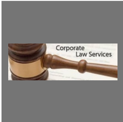
Corporate Laws Service