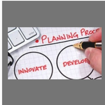
Management Advisory Services