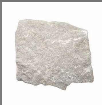
Calcined Dolomite Lump