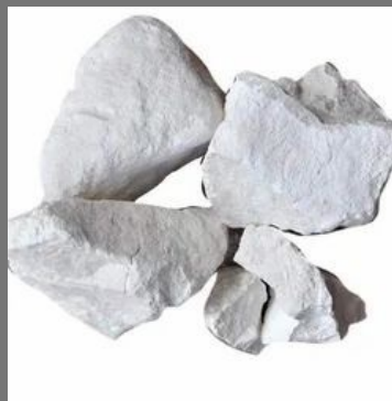
Burnt Dolomite Stone