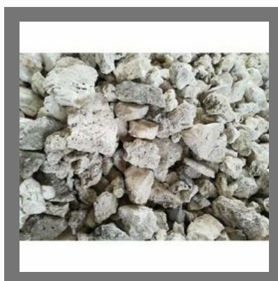
Quick Lime Lump