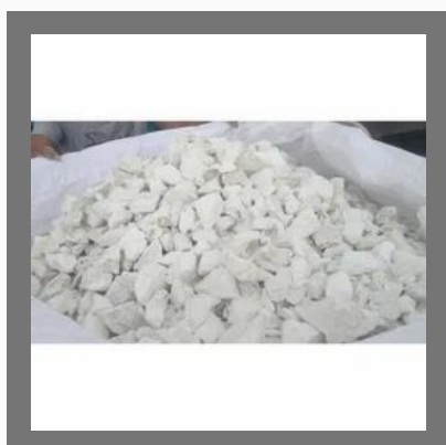
Burnt Lime Lump