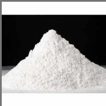
Hydrated Lime Powder