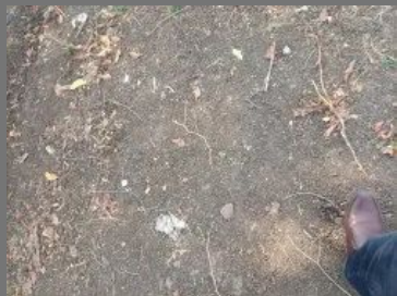
Iron ore fines high grade