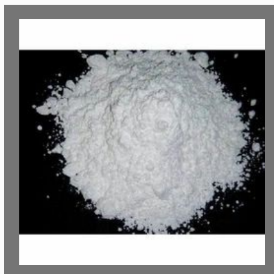
Slaked Lime Powder