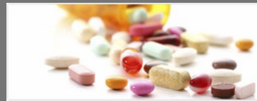
Free Drug Assistance Program