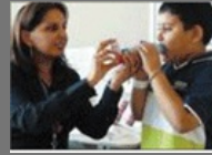
Asthma Treatment Service