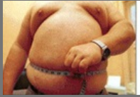
Obesity Treatment Service