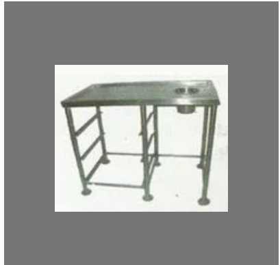
Solid Dish Landing Table with Chute