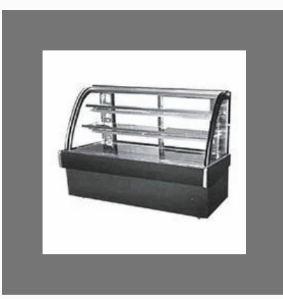
Bakery Display Unit