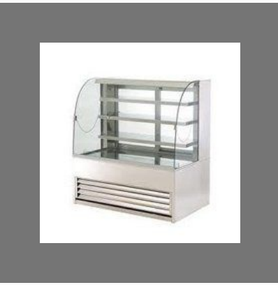
Bakery Display Unit