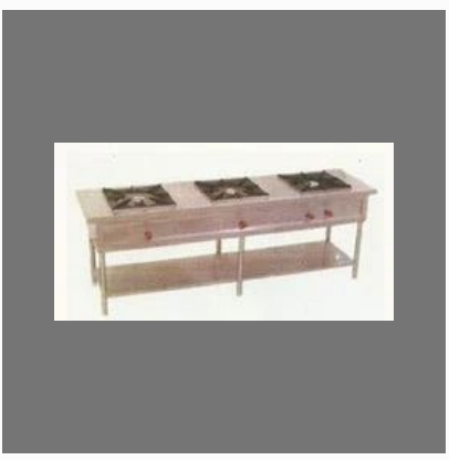
Three Burner Gas Range