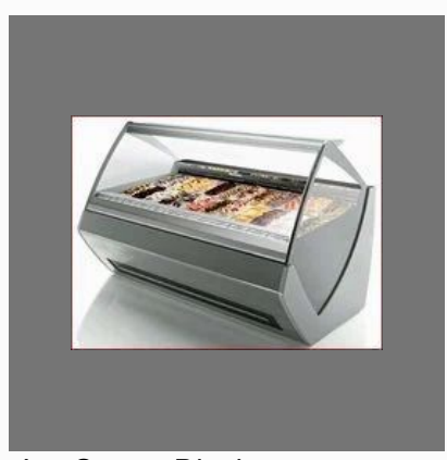
Ice Cream Display