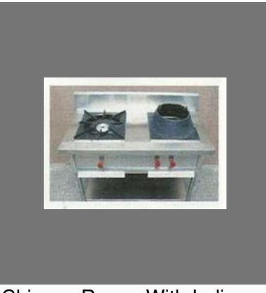
Chinese Range With Indian Burner