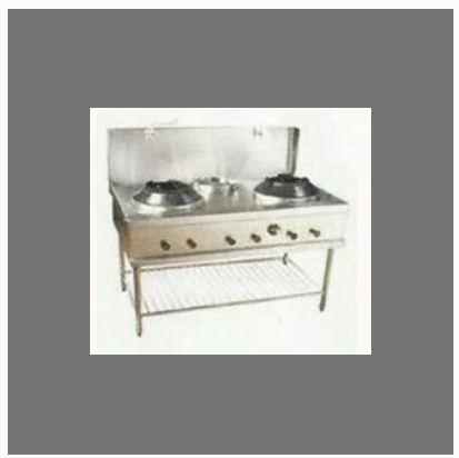
Chinese Cooking Range