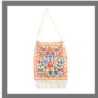
Kashmiri Embroidery Bag