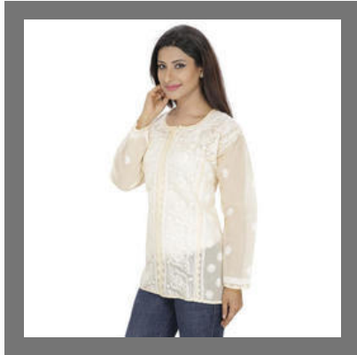
Short Lucknowi Crepe Kurti