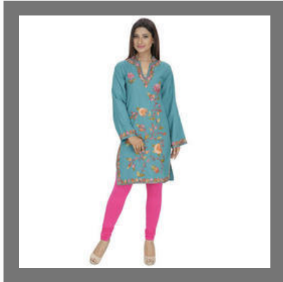
Kashmiri Embroidered Kurti