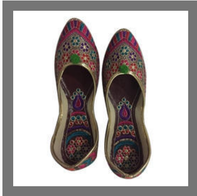
Ladies Handmade Jutti