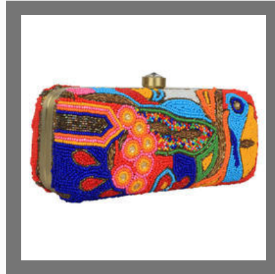
Ladies Gujrati Clutch Bag