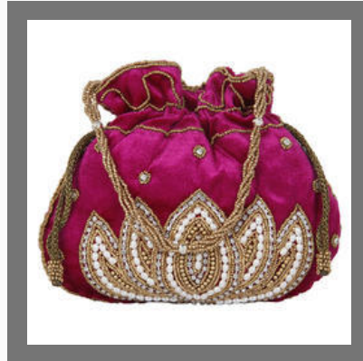
Ladies Potli Purses