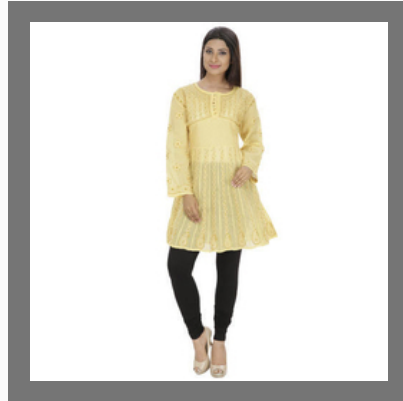
Lucknow Anarkali Kurti