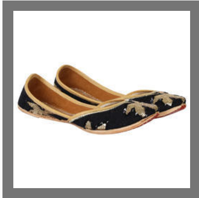
Embroidered Ladies Ethnic , Leather , Footwear , Punjabi , Jutti , Shoe, Slip on