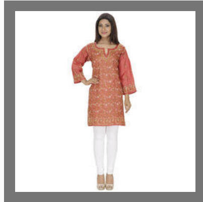
Long Lucknowi Silk Kurti