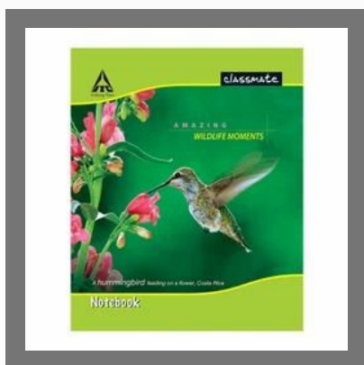
Classmate Notebook 190 X 155