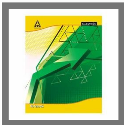
Classmate Graph Book