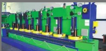
Vertical Strip Enameling Plant