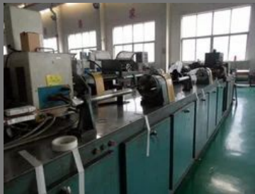
Horizontal Glass Covering Varnishing Lacquering Plant