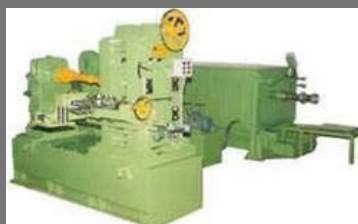
Tandem Wire Flattening Mill