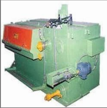
Fine Wire Drawing Machines