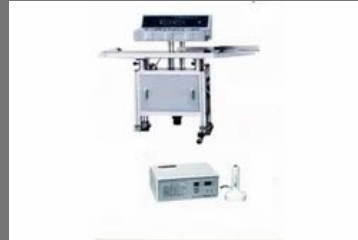
Horizontal Tape Insulating & Sintering Machine