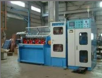
Medium Wire Drawing Machines