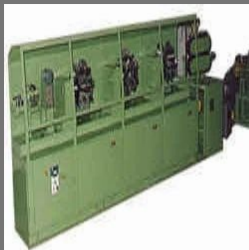
Horizontal Paper Covering Machine