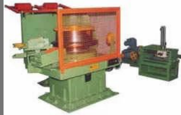
Bull Block Wire Drawing Machines