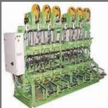
Vertical Covering Machine