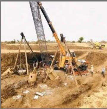
Tripod Piling Services