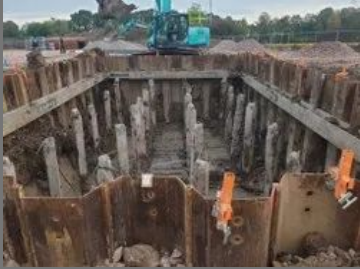
Residential Concrete Piling Service