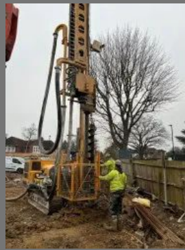
Rig Piling Service