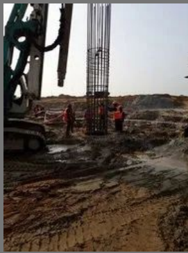
Pile Foundation Services