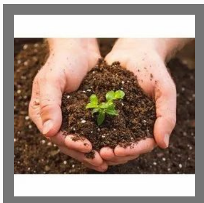
Sub Soil Investigation Services