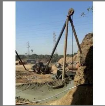
Commercial Concrete Piling Service