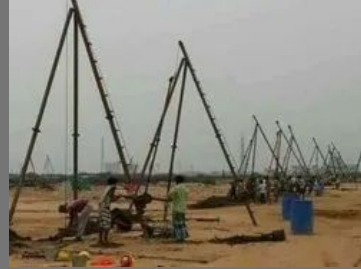
Liner Pile Service