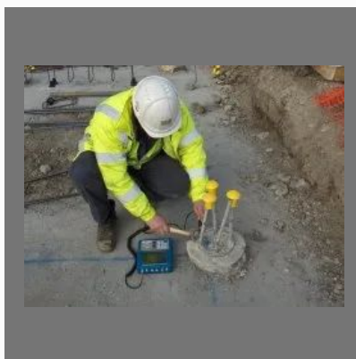
Low Strain Pile Integrity Testing Services