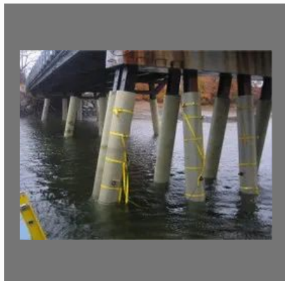
Bridge Piling Service