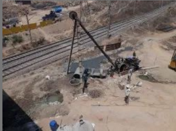
Machinery Winch Pile Foundation Service